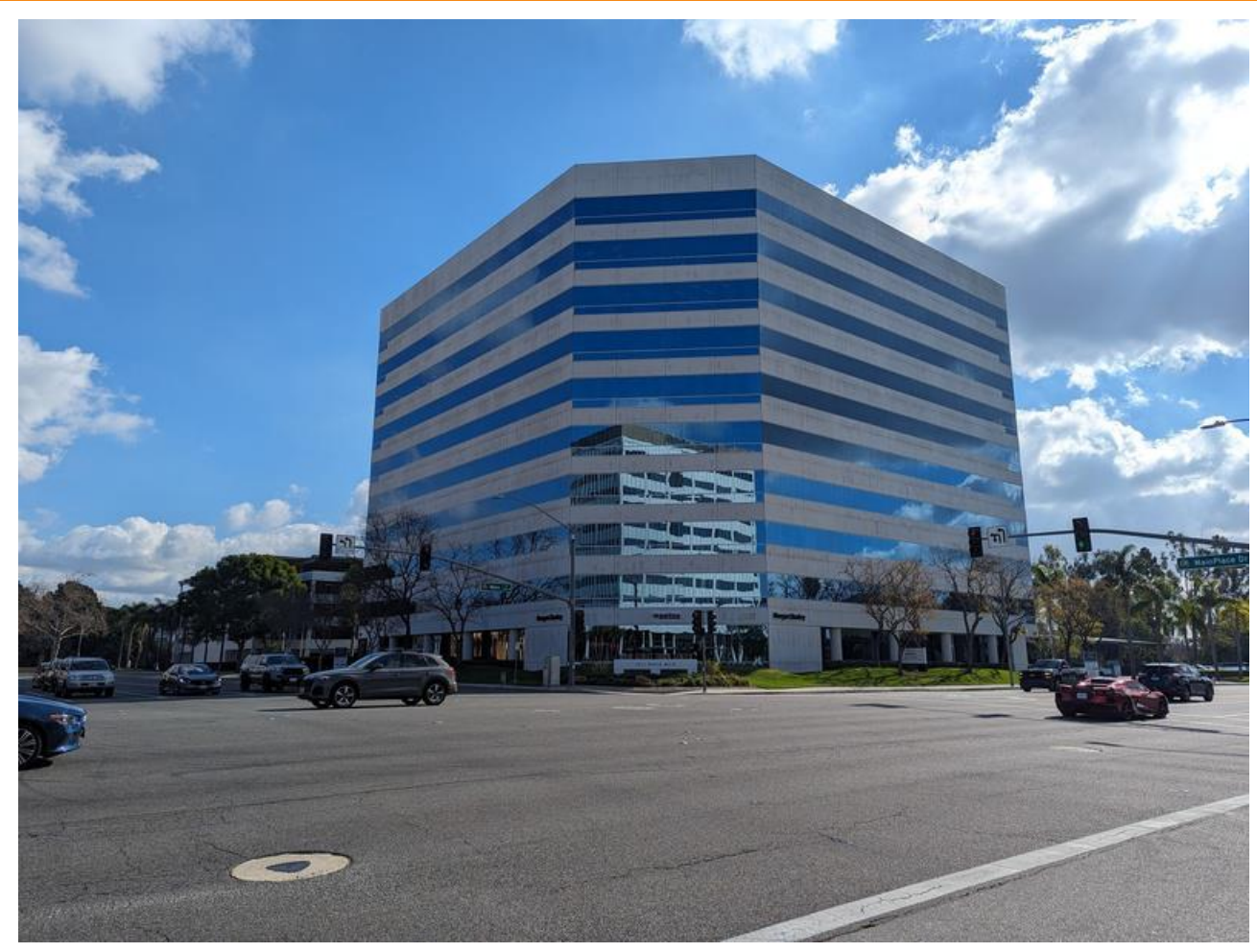
Aerial View View from Main Street