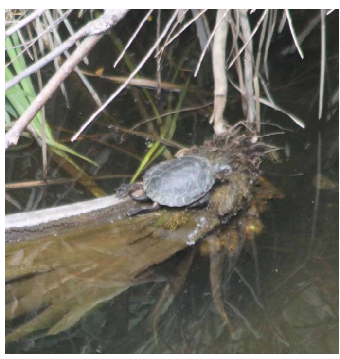
Western pond turtle

Based on the evaluation of mitigation opportunities in the County, priority conservation areas were identified, including candidate parcels and properties that could be considered for wilderness preservation purposes. Properties were then selected for acquisition and restoration. These properties are protected to enhance wildlife connectivity, safeguard sensitive species and preserve substantial parcels of valuable habitat.