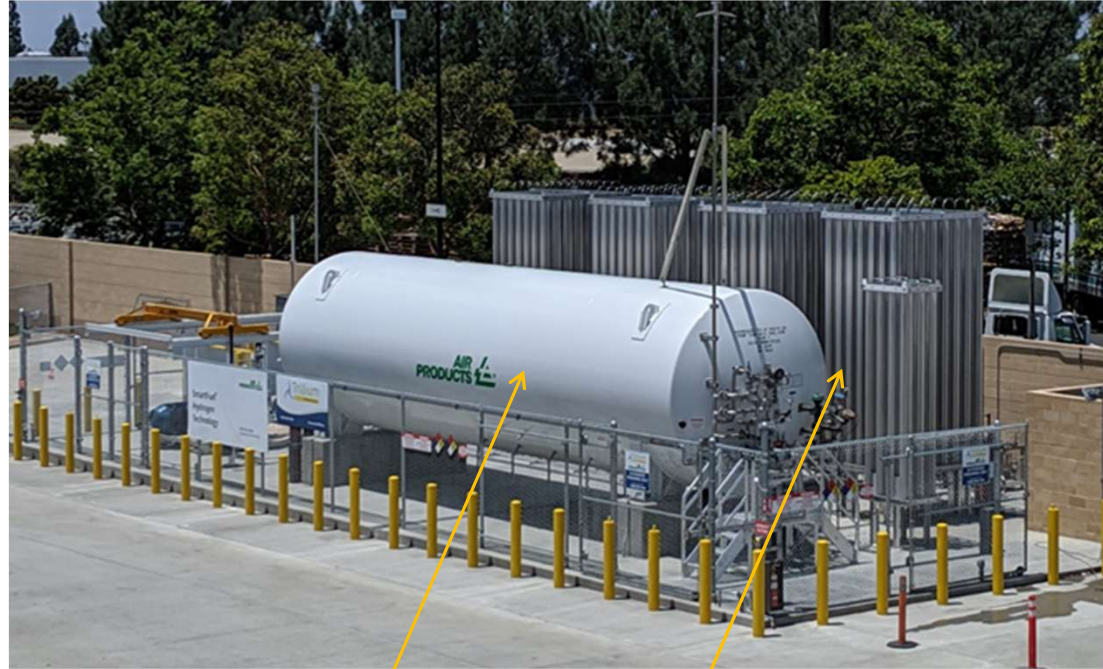
Liquid Storage Tanks and Vaporizers - Leased