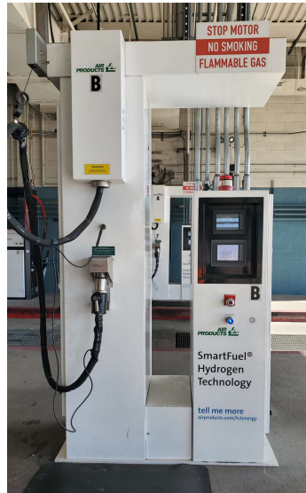
2X Fuel Dispensers - Proprietary