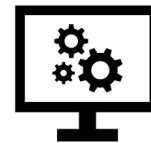
Operating Software - Proprietary