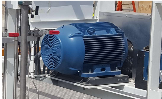
2X Cryogenic Hydrogen Compressor Pumps - Proprietary