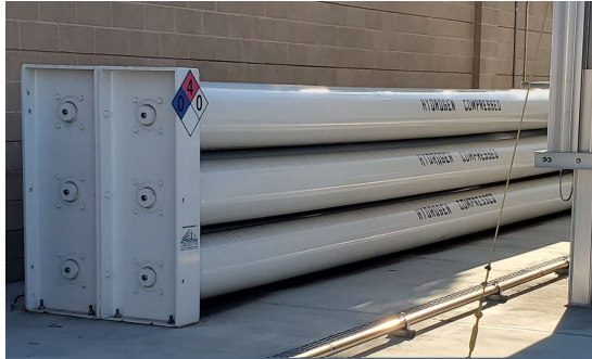
Vapor Storage Tanks