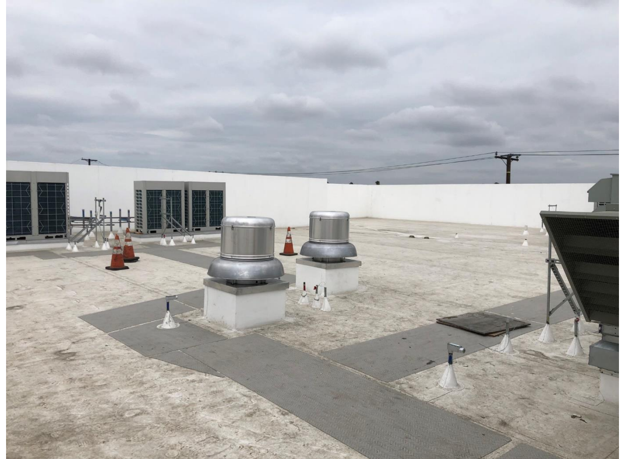
Roofing Material and Mechanical Equipment