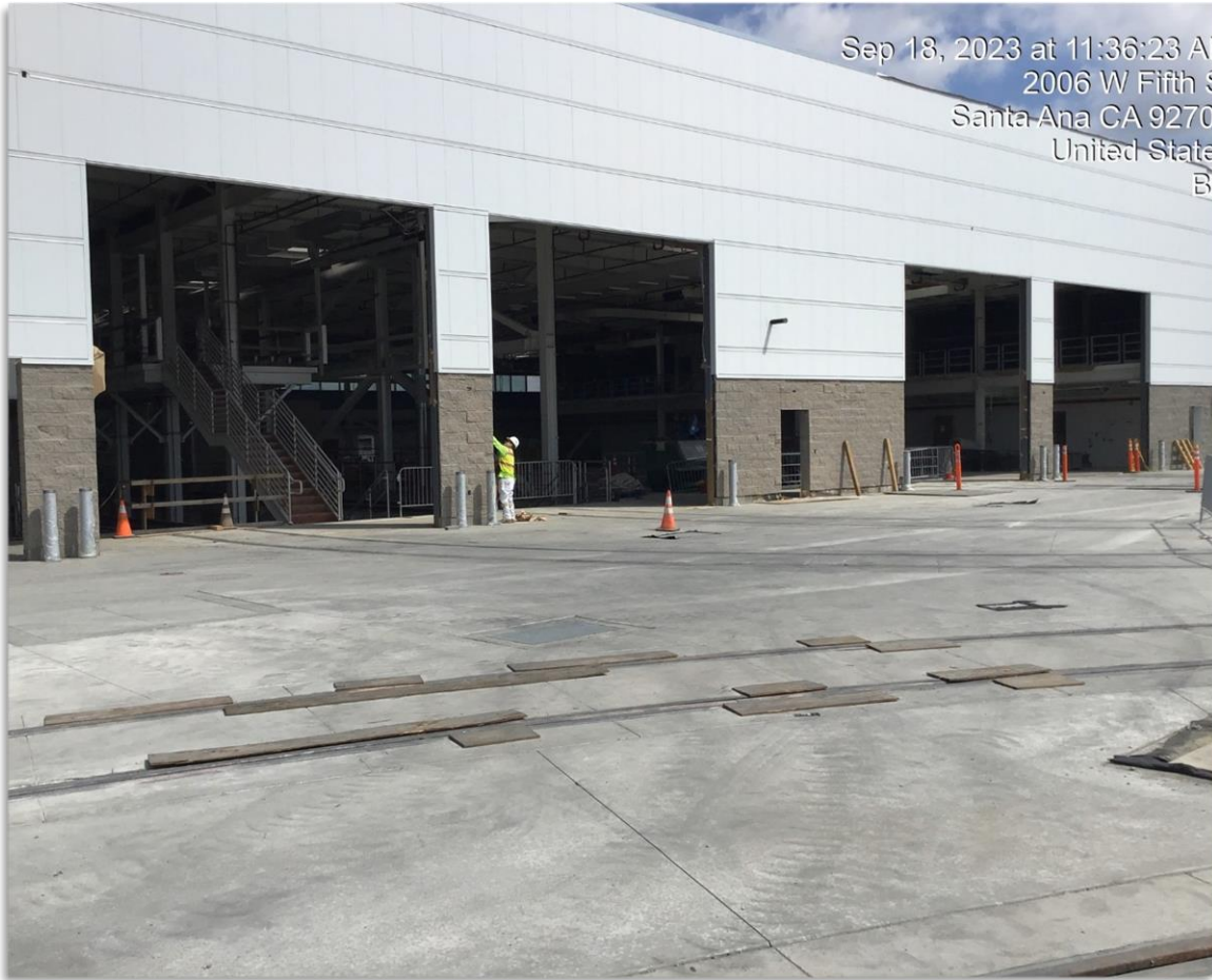
Preparation for Bi-fold Doors