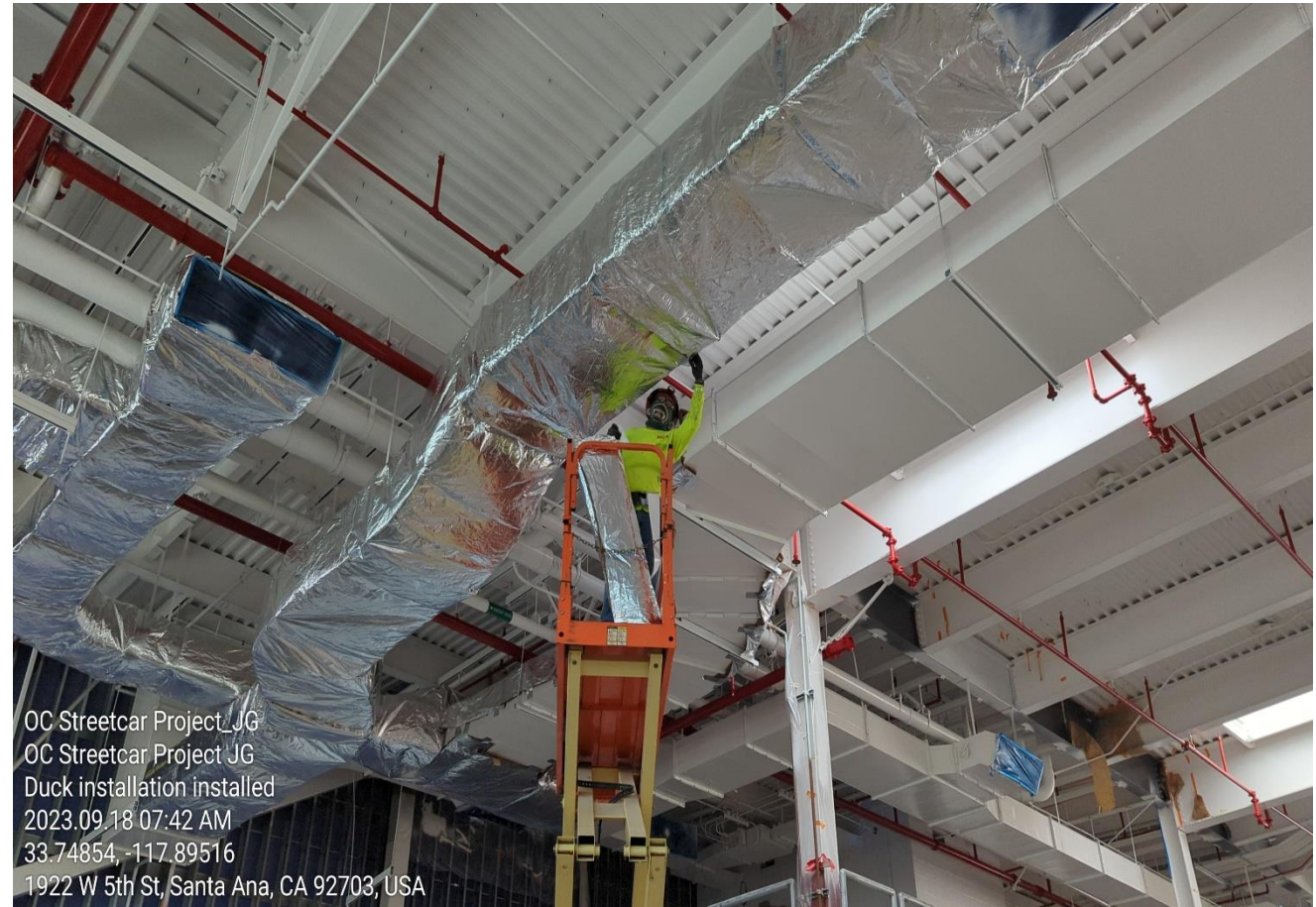
Installation of Duct Insulation