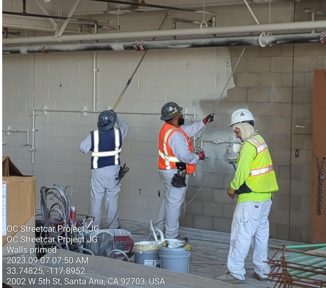
Interior Masonry Wall Painting