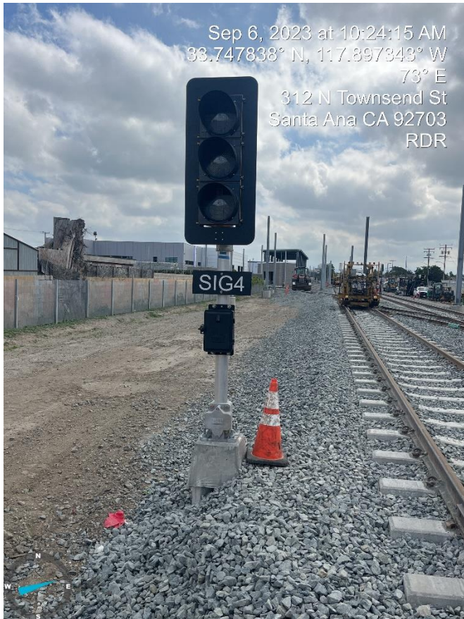
Train Signal Along Ballast Tracks