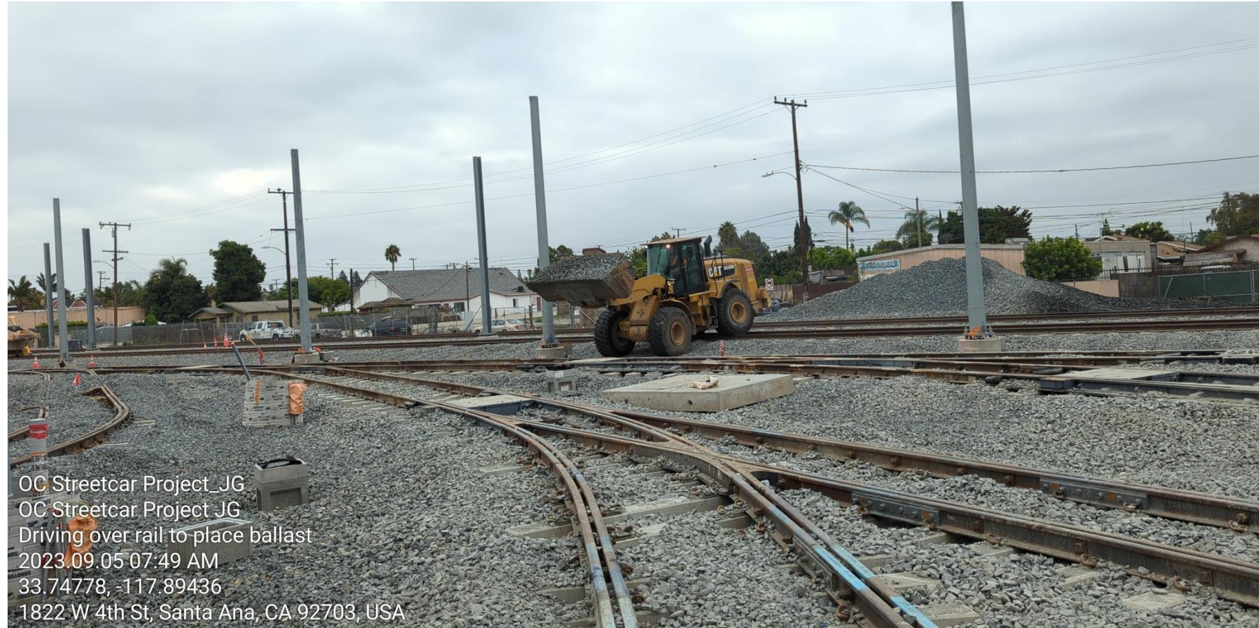
Ballast Placement and Overhead Contact System (OCS) Poles at Yard Rails