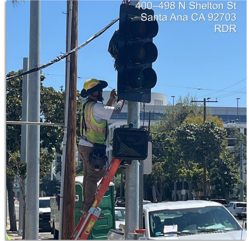
Traffic Signal Pole Installation