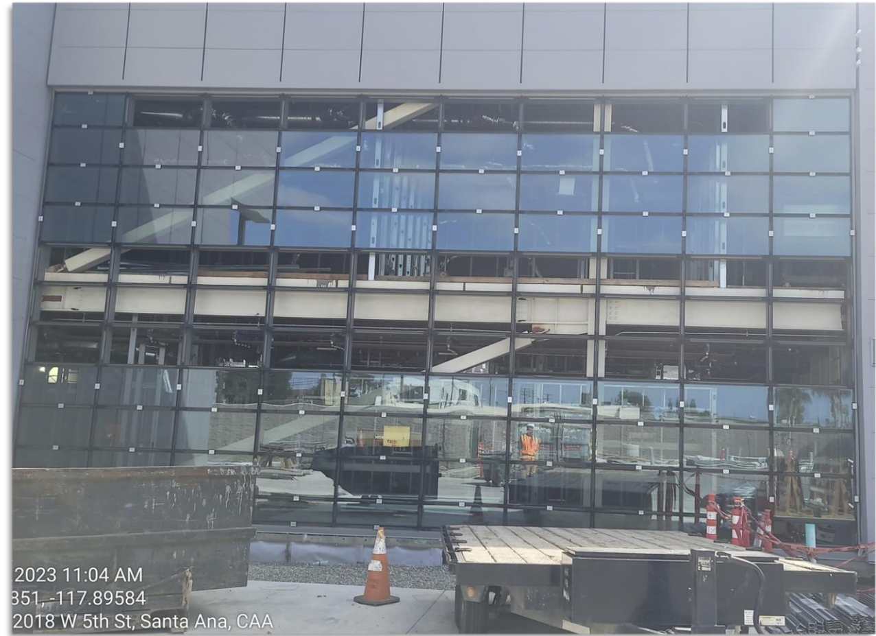
Installation of Exterior Cladding and Windows