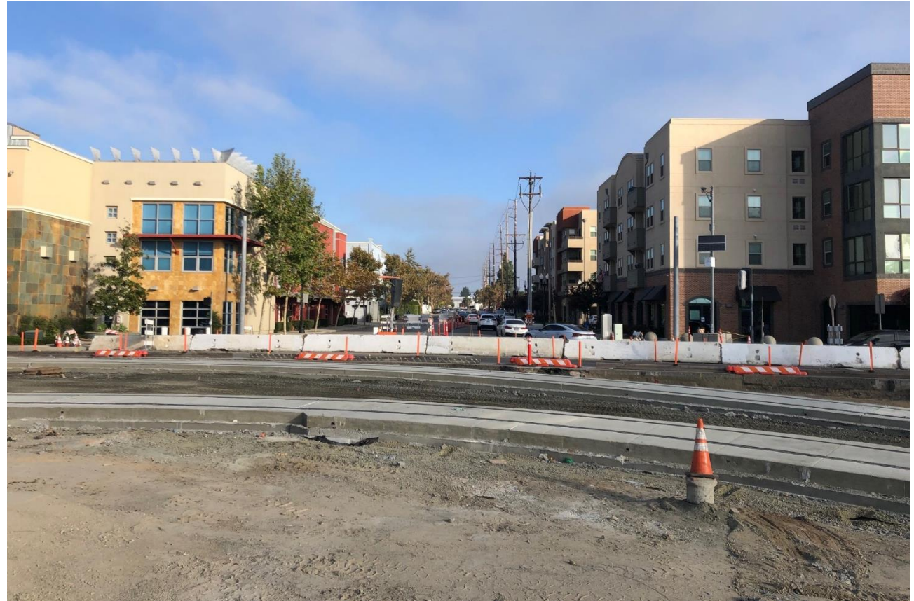
Curve Track - Santa Ana Boulevard/Santiago Street Intersection