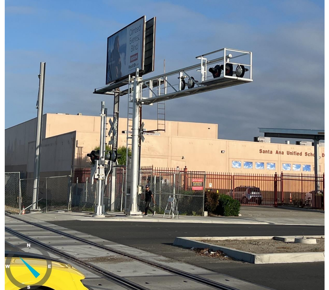
Fairview Train Crossing Signal and Gate System