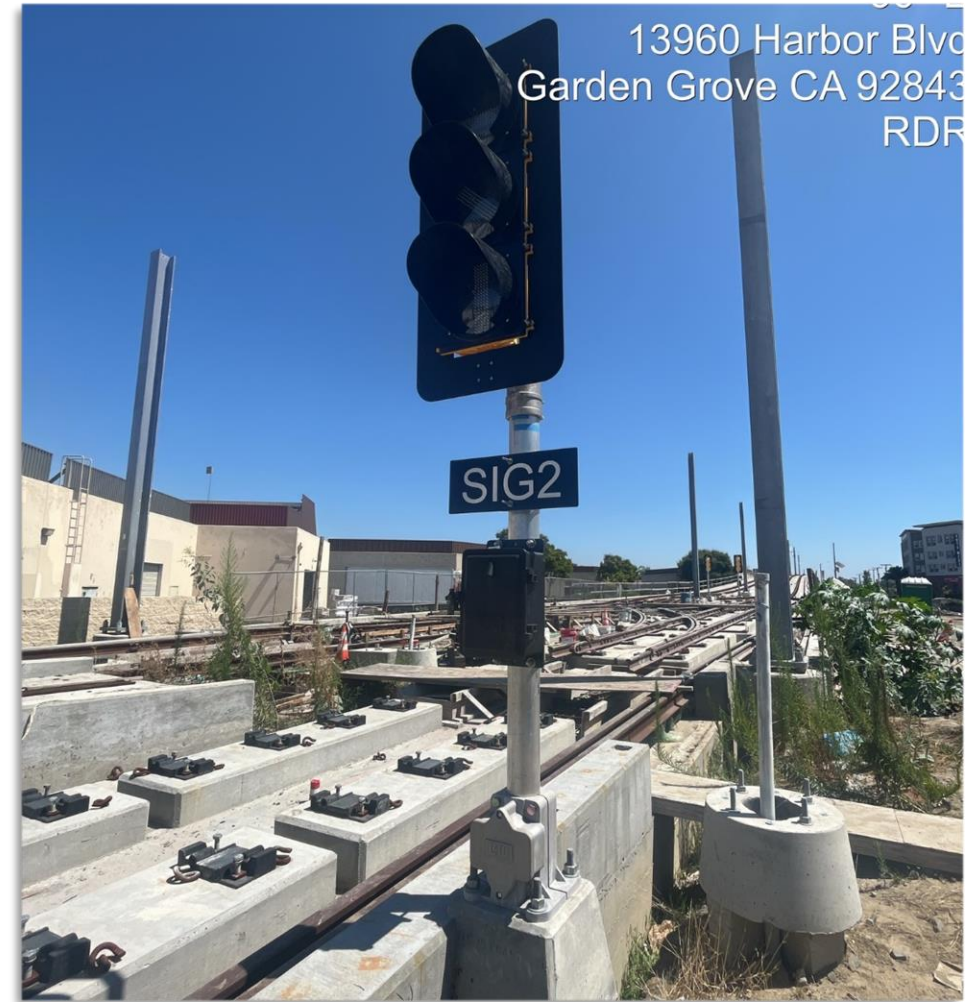
Double Cross-Over and Train Signal at Harbor Station