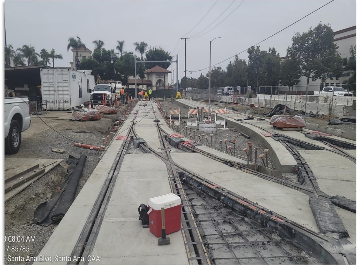
Santa Ana Regional Transportation Center Station and Diamond Cross-Over Tracks