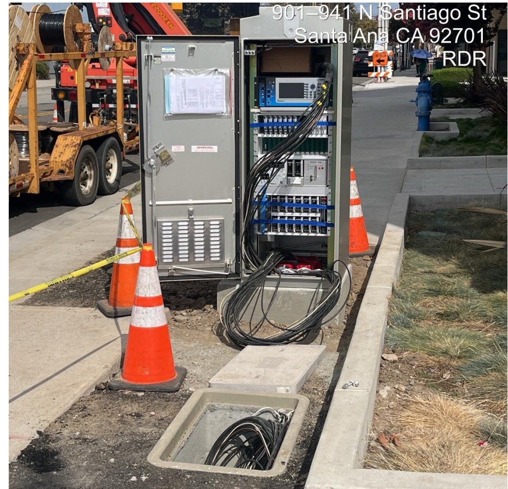
New Traffic Signal Controller Cabinet