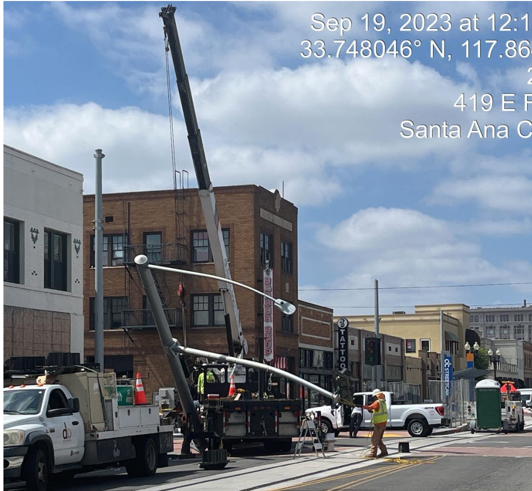
Traffic Signal Pole Installation