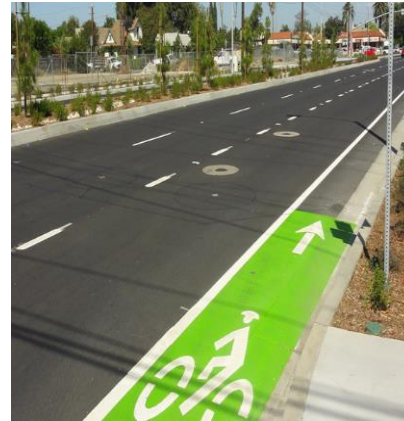
Grand Avenue Improvements City of Santa Ana