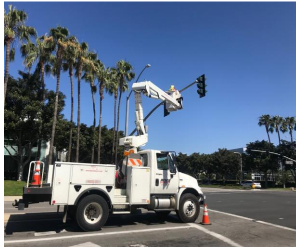
Irvine Center Drive / Edinger Avenue City of Irvine