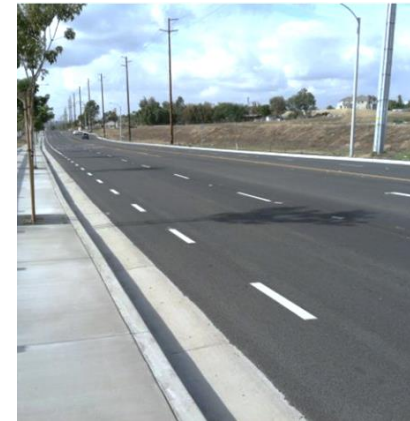
Bastanchury Road Improvements City of Yorba Linda