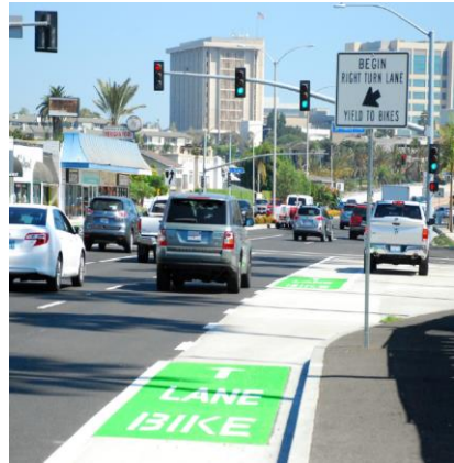
Newport Boulevard Improvements City of Newport Beach