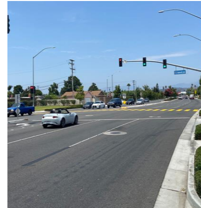
Brookhurst Street Improvements City of Anaheim