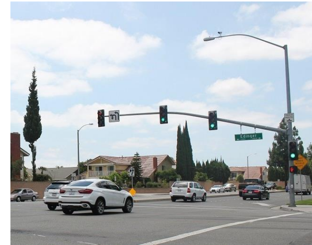
Edinger Avenue City of Fountain Valley