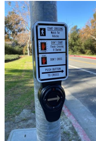
Marguerite Parkway City of Mission Viejo