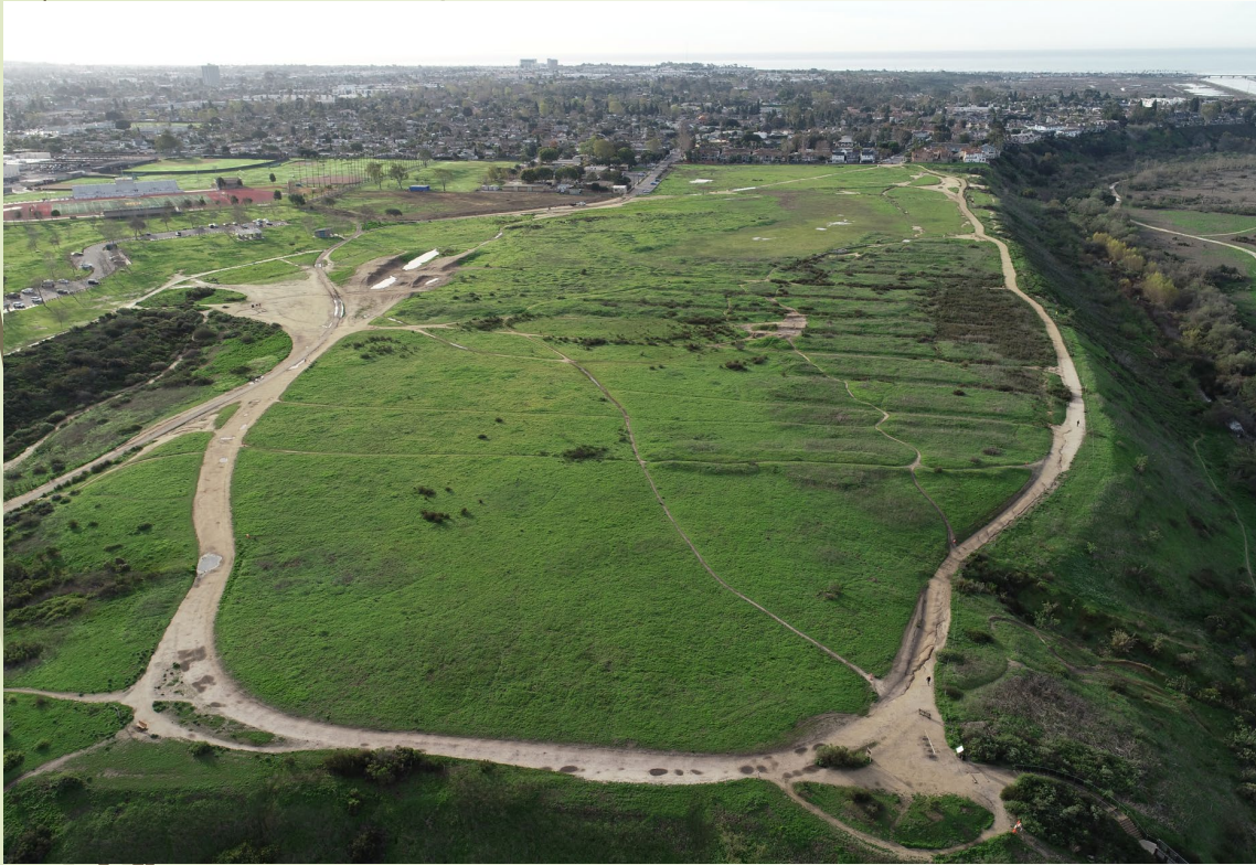
Annual grasses, forbs, on Mesa