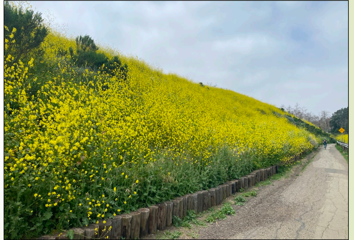
Black mustard, poison hemlock on slopes