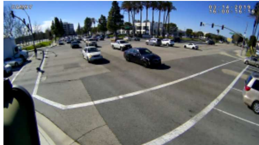
Example of count camera