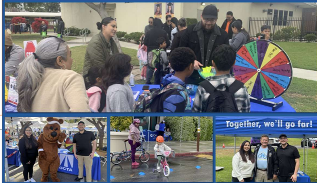
Day of Event Highlights and Community Partner Collaboration