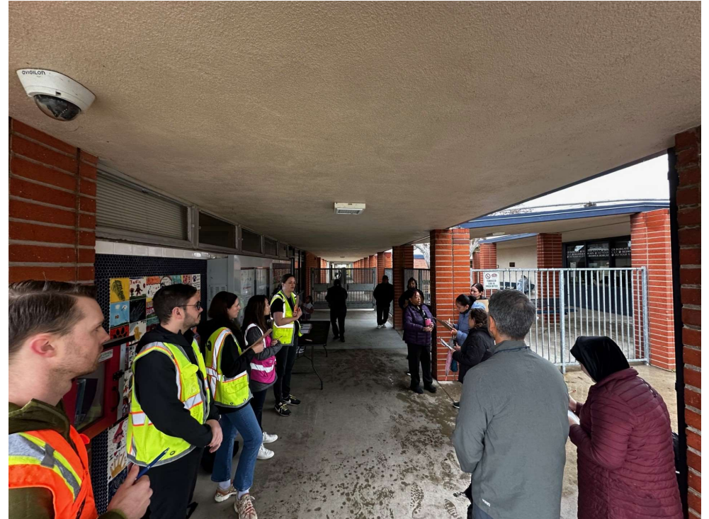
Walk Audit at Beswick Elementary in Tustin