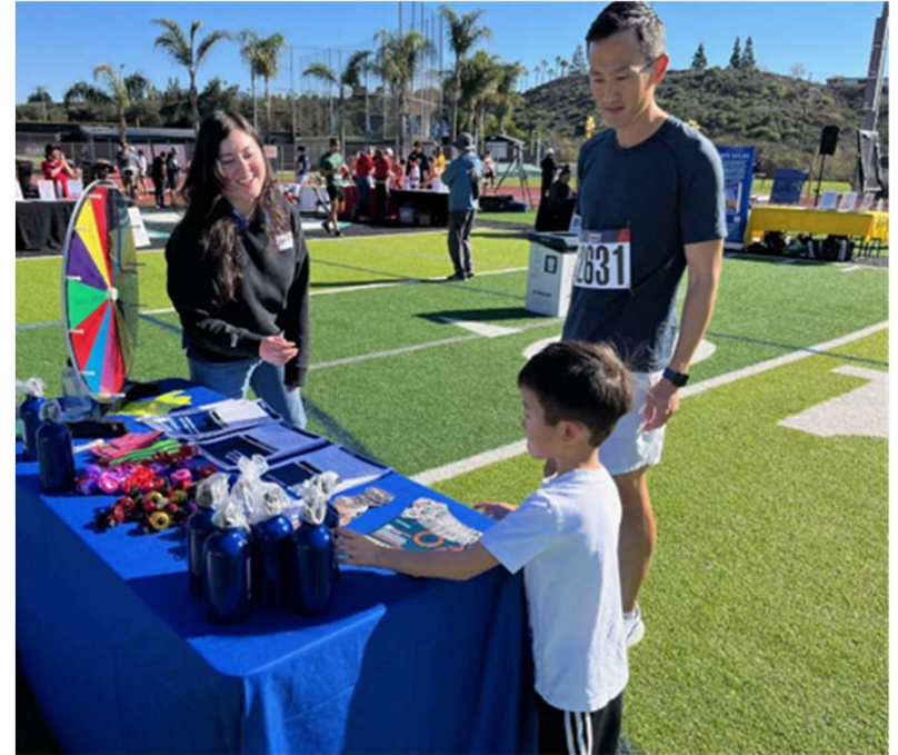
BRAVE Race 1k 5k and 10k for the Joyful Child Foundation event