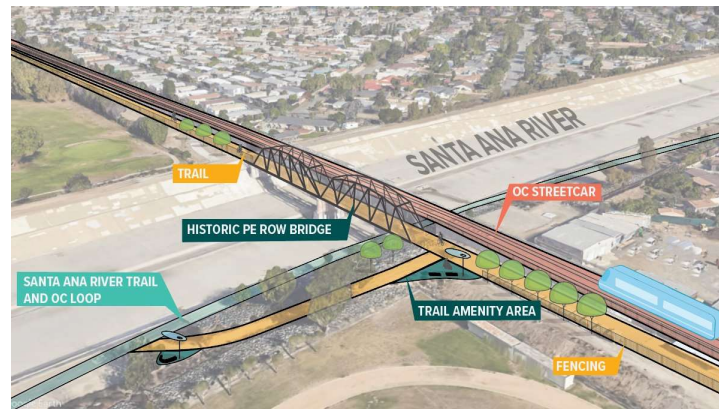
Bridge/Santa Ana River Trail Concept