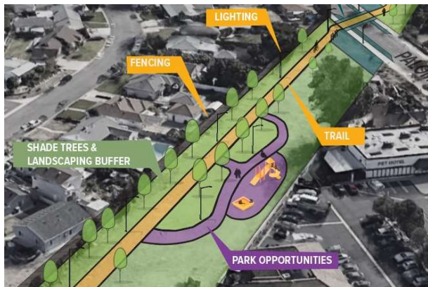
Wide Section Trail Side Element Concept