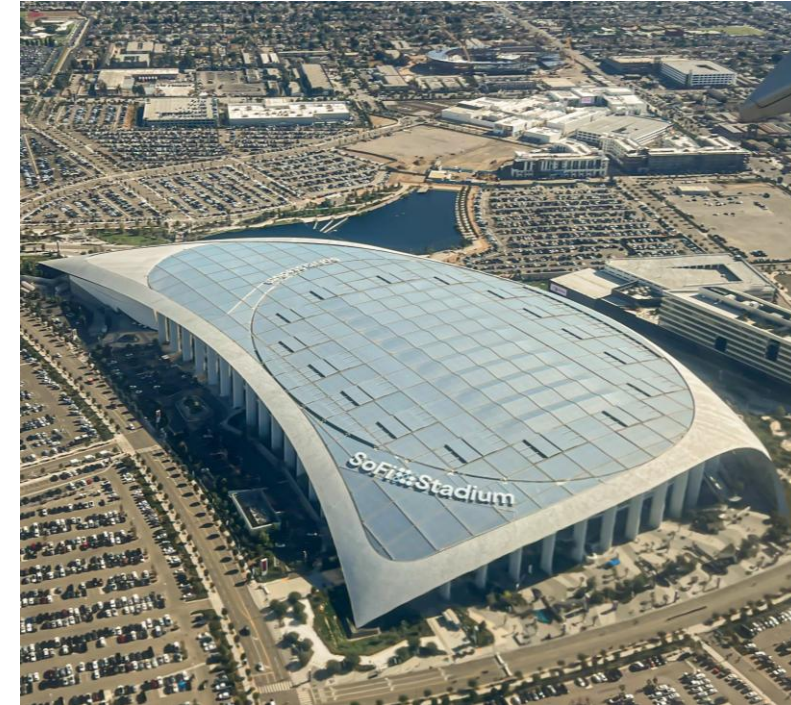
USA – United States of America