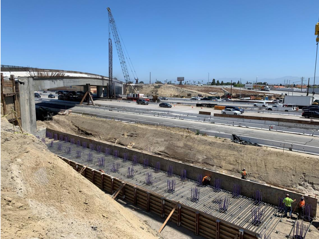
Goldenwest Street bridge construction