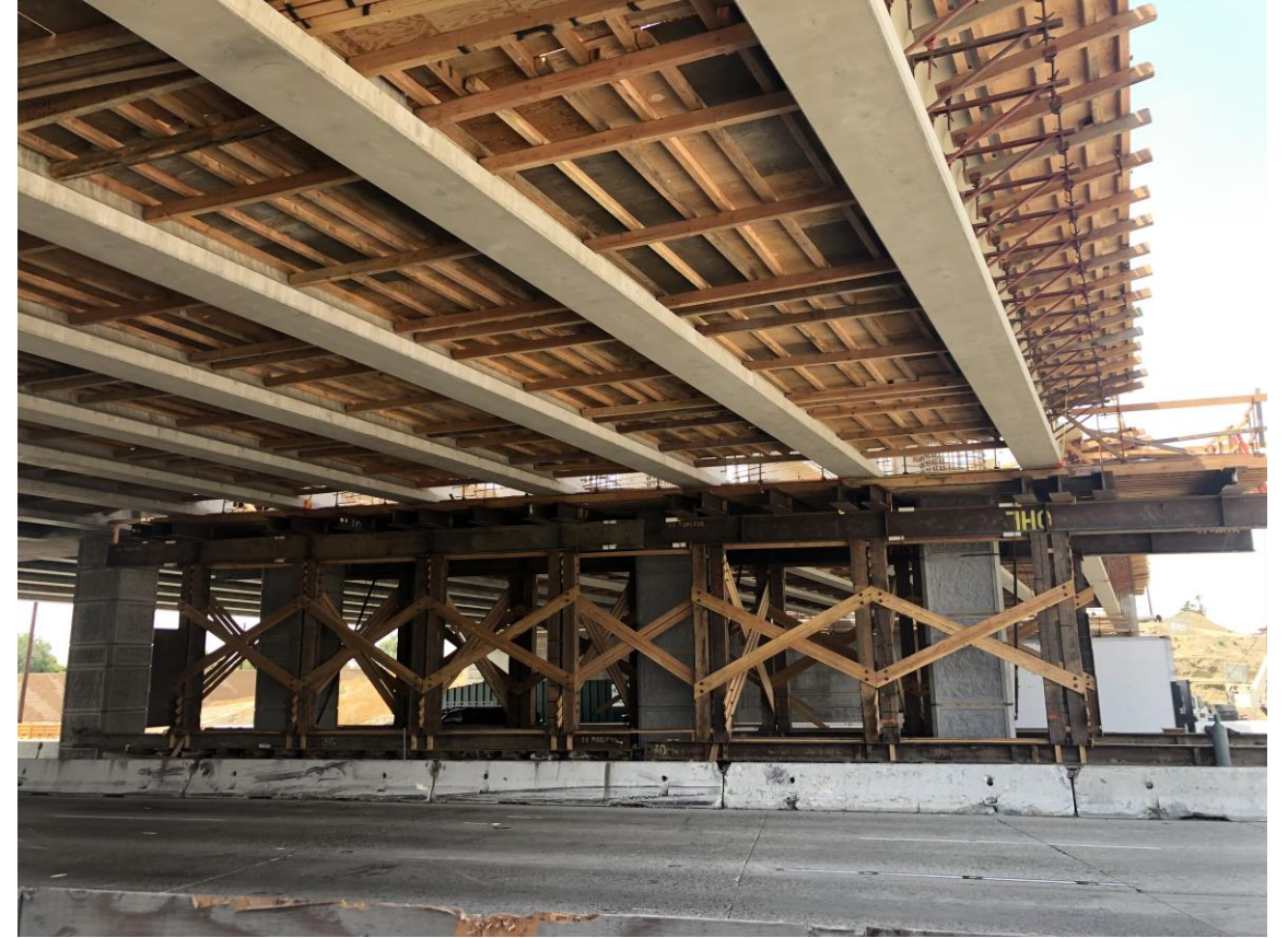
Bolsa Chica Road bridge construction