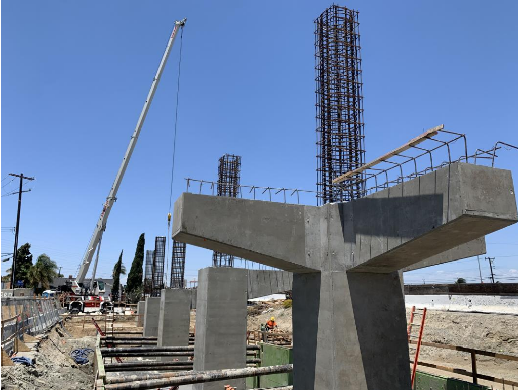
Heil Avenue pedestrian overcrossing construction