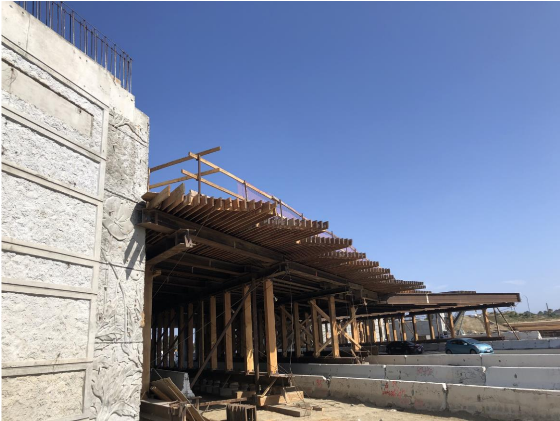
Brookhurst Street bridge construction