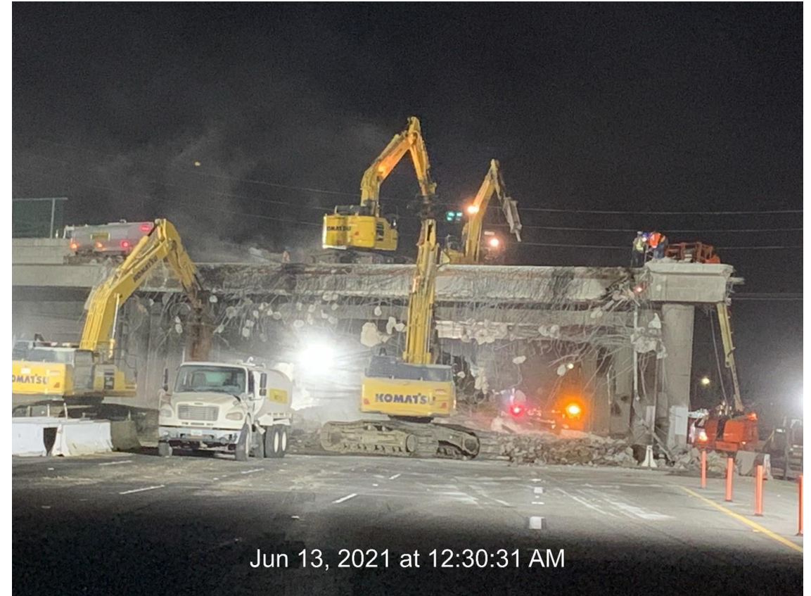
Warner Avenue bridge demolition