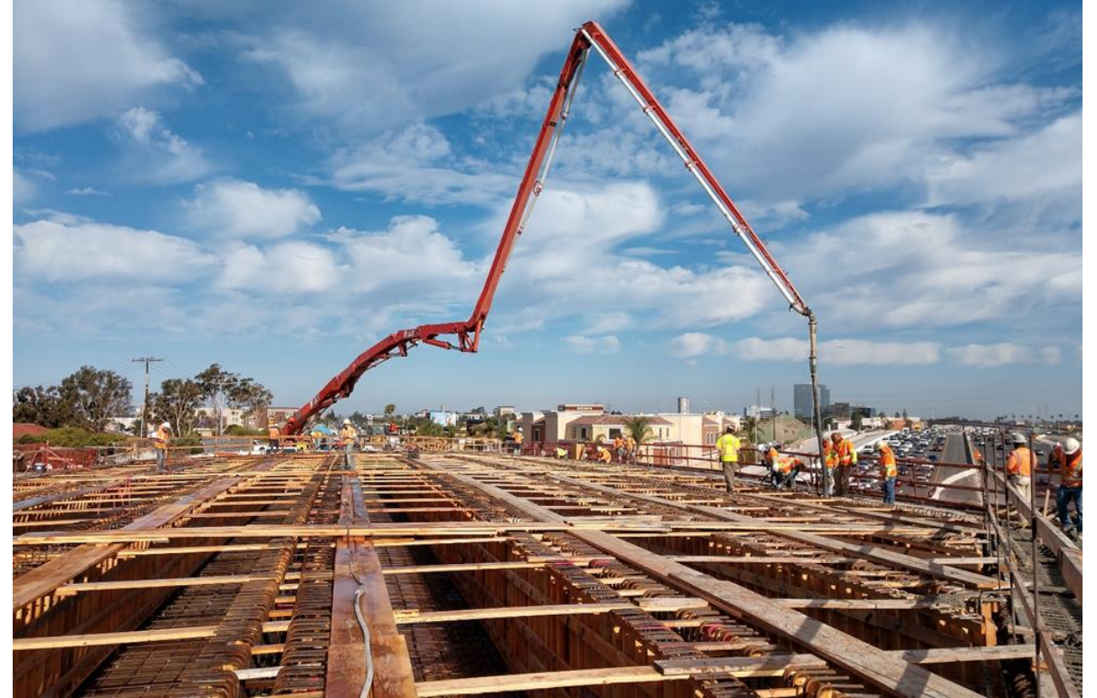
Edinger Avenue bridge construction