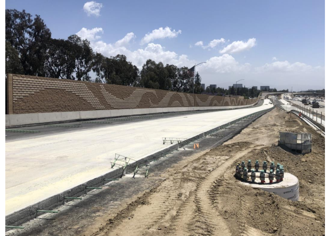
Fairview Road bridge and ramp construction