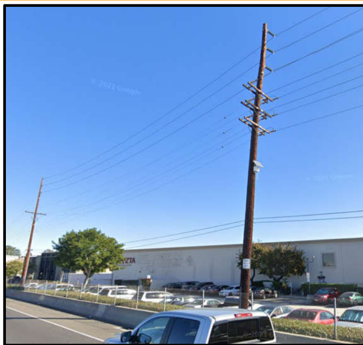
Relocate Overhead to Underground Conduits