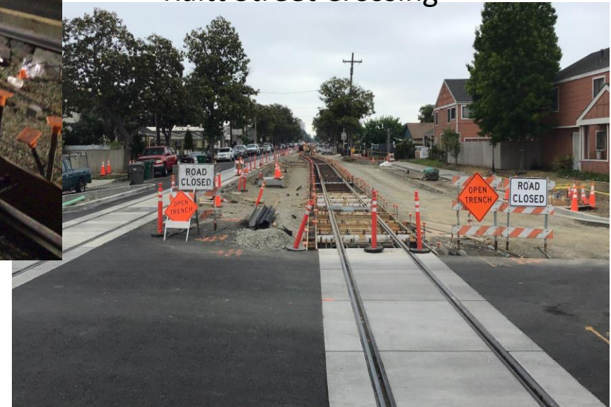
Raitt Street Crossing