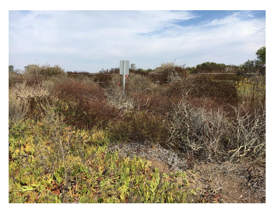
Photo of same entry point looking at the back of the sign. Trail has been obscured with dead vegetation.

This picture depicts the main access point onto the decommissioned trail. Fence line has been fixed and signage placed.