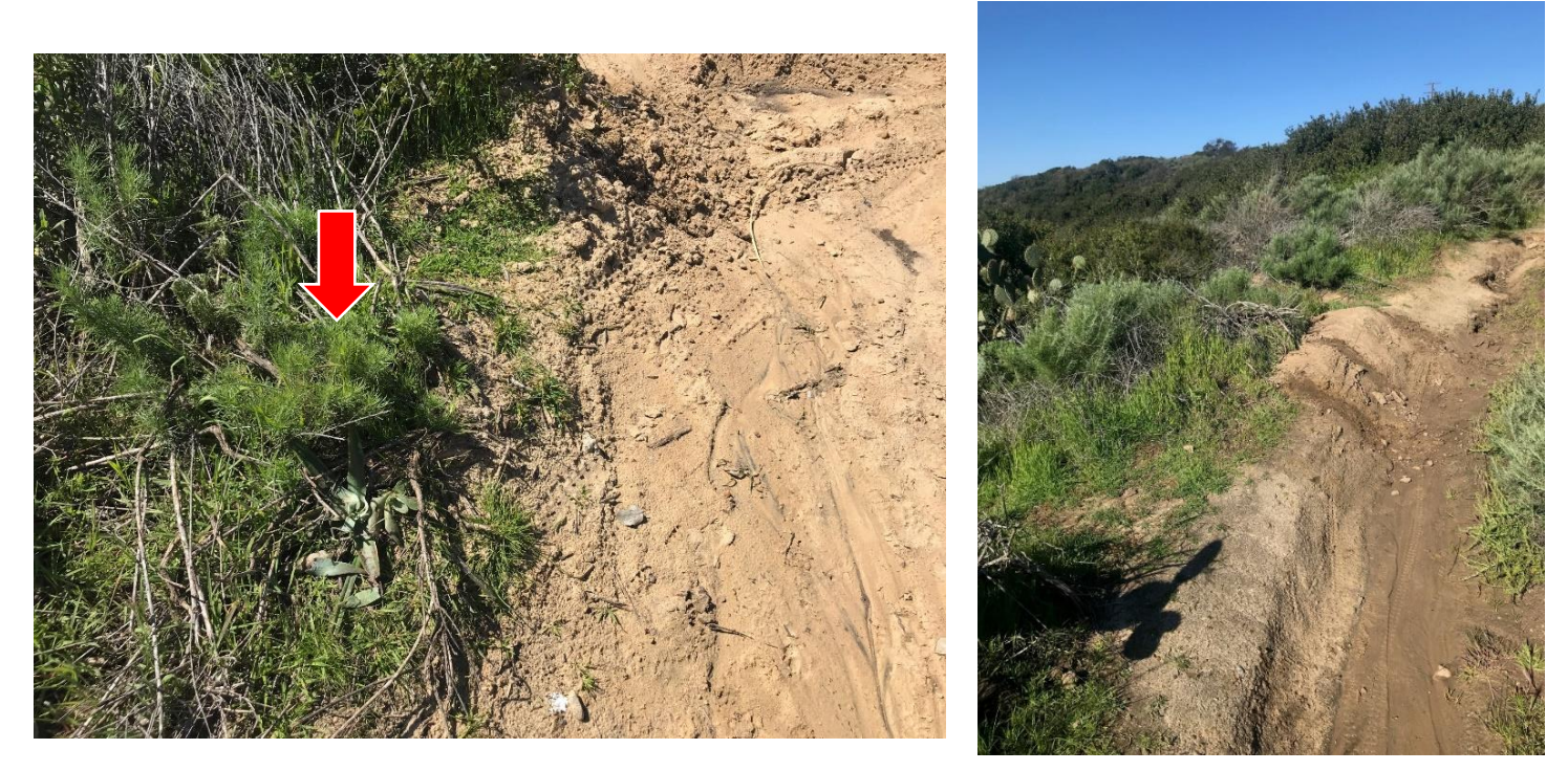
Dudleya crushed by mountain biking activity (above). Dirt berm built by mountain bikers (right).