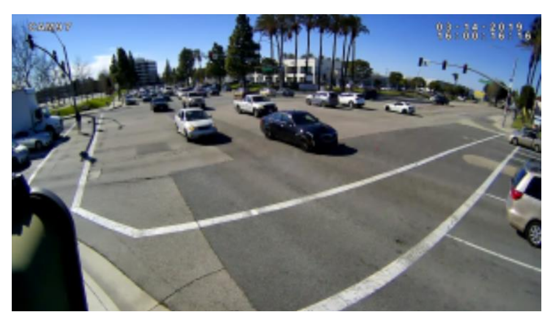
Example of count camera, counts unlimited