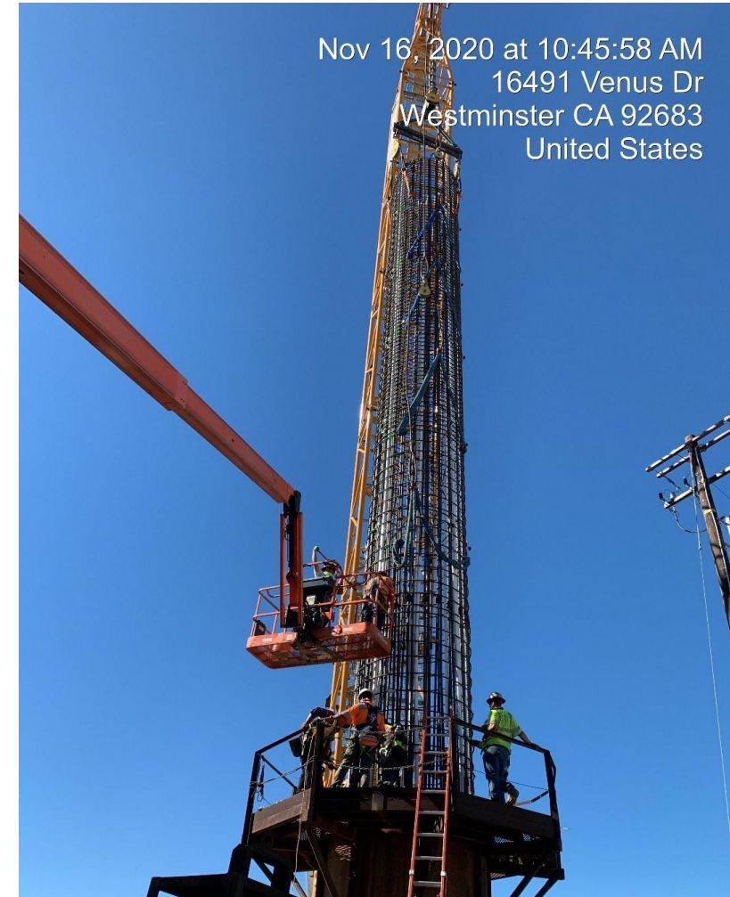
Heil Avenue pedestrian overcrossing (POC) construction