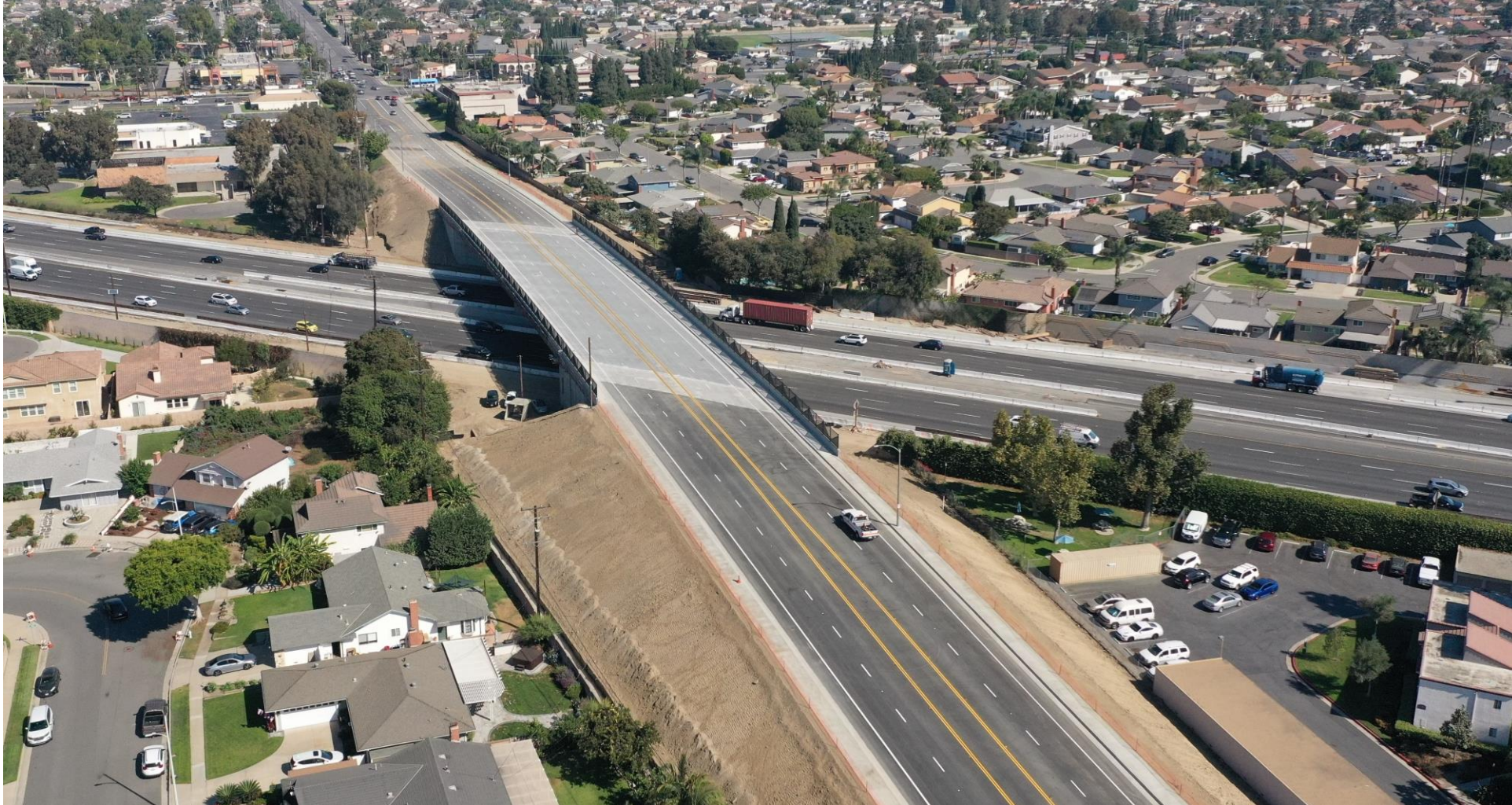
Bushard Street bridge complete