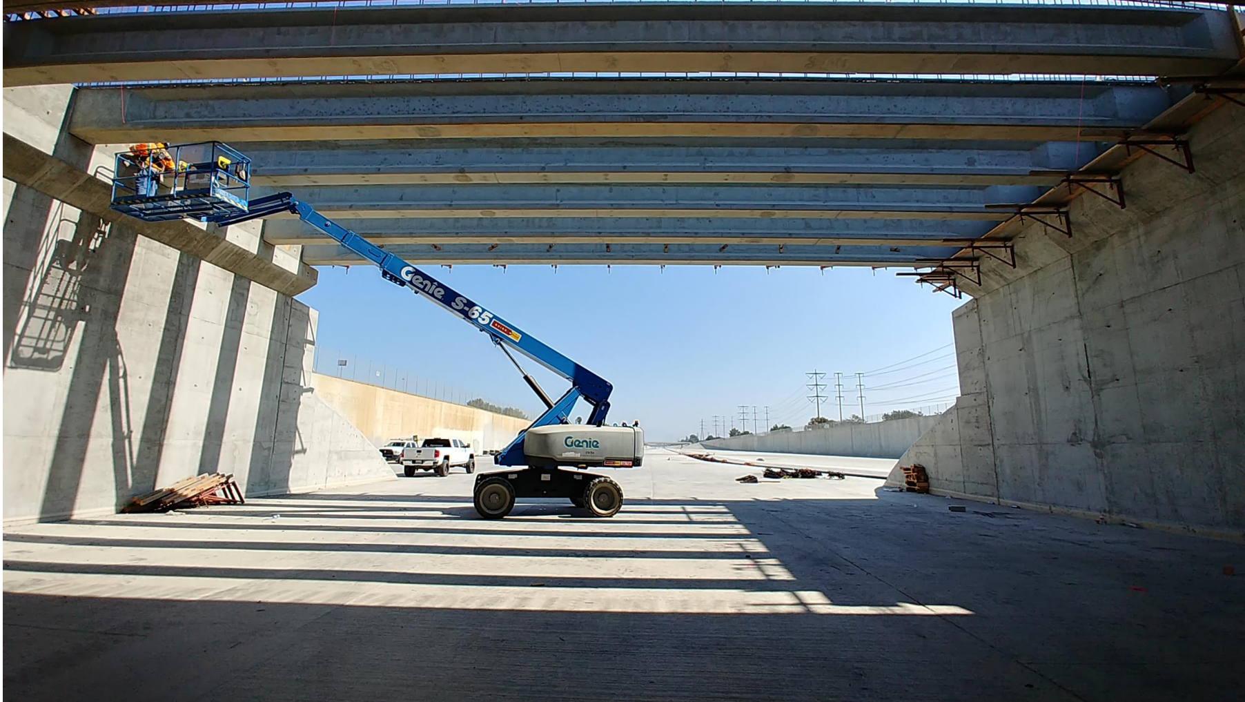
Santa Ana River bridge construction