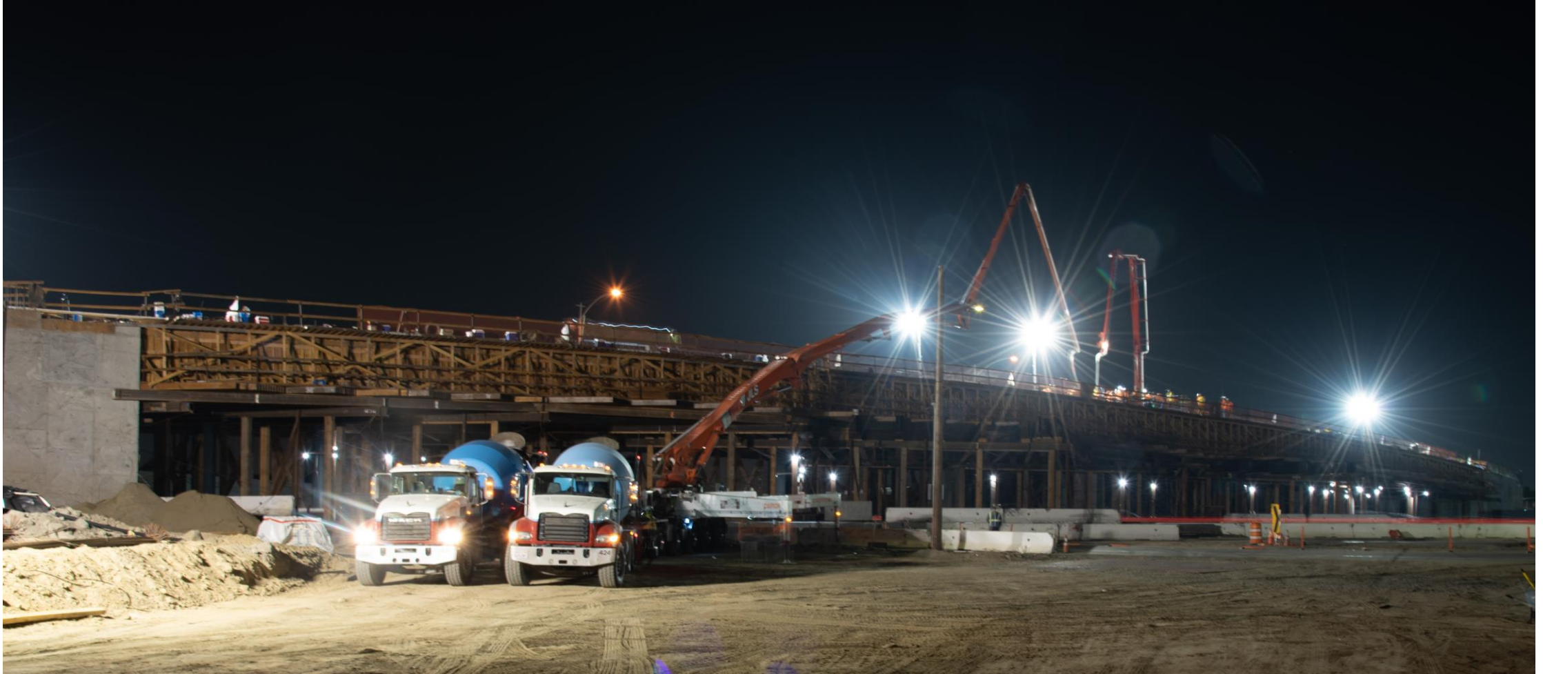
Bolsa Avenue bridge construction