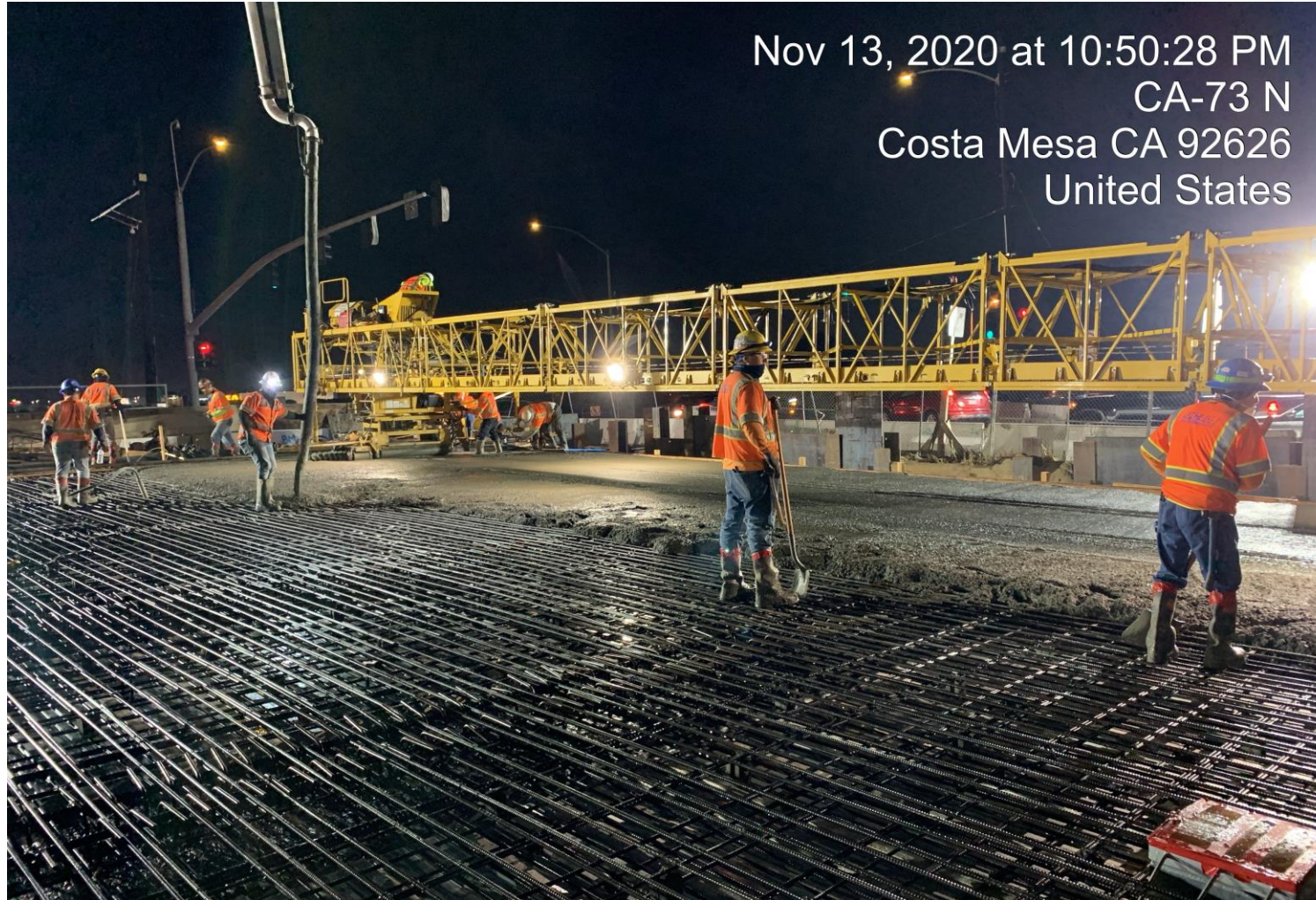
Fairview Road bridge construction