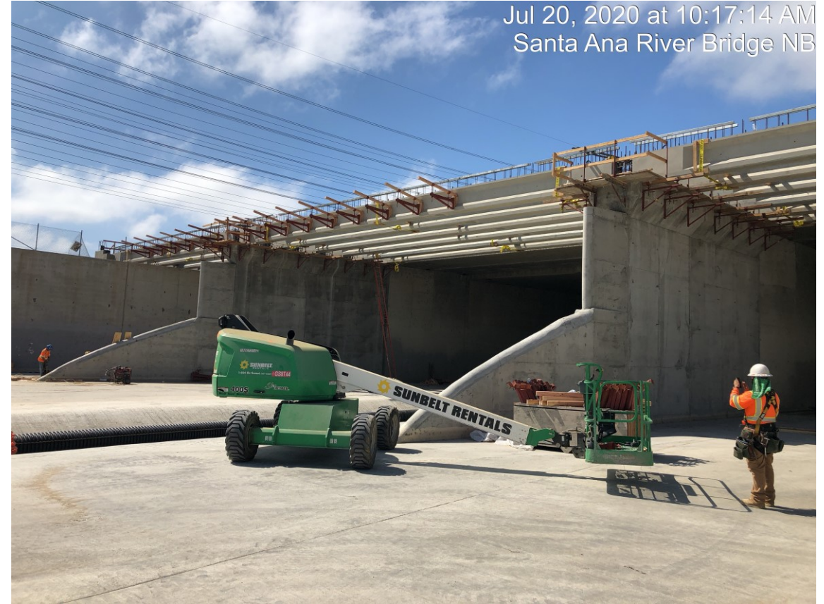
Santa Ana River bridge construction