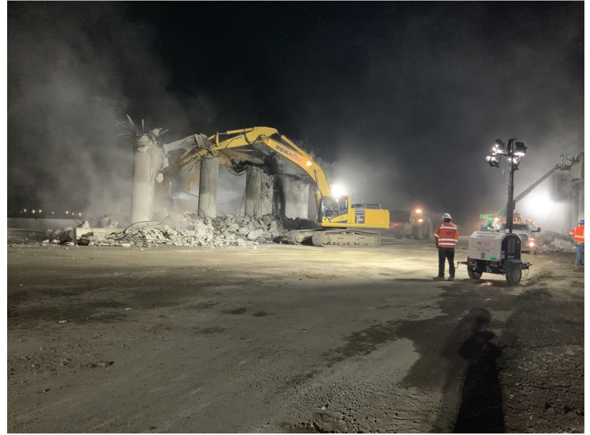
Edwards Street bridge demolition