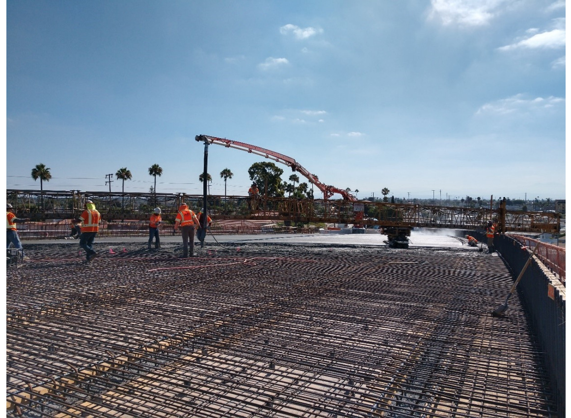
McFadden Avenue bridge construction