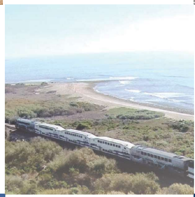
Adopted on November 25, 2019