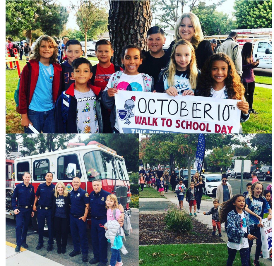
Walk to School Day, Rossmoor Elementary