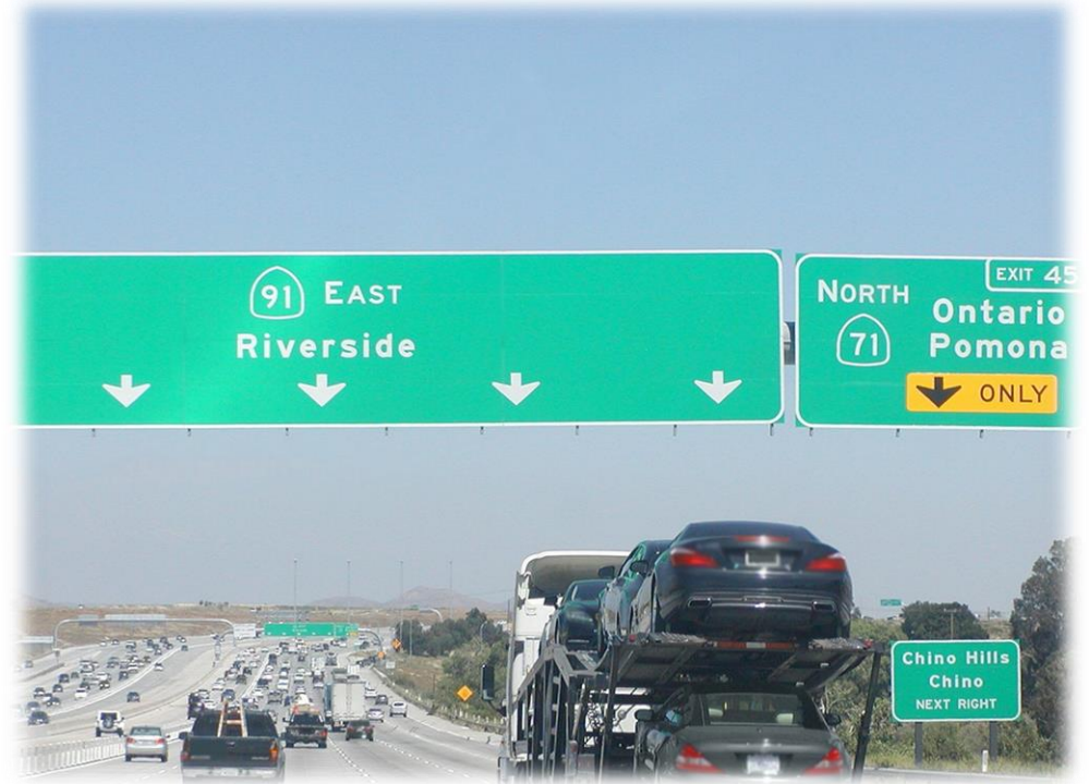
SR-71 - State Route 71