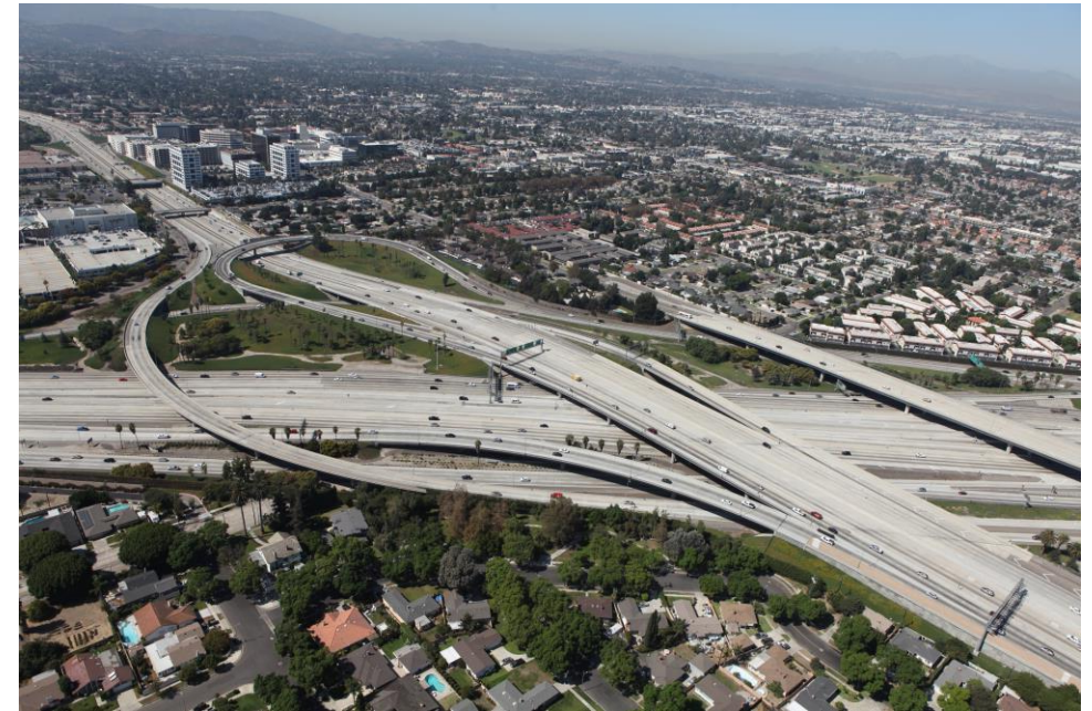
State Route 22 Horseshoe