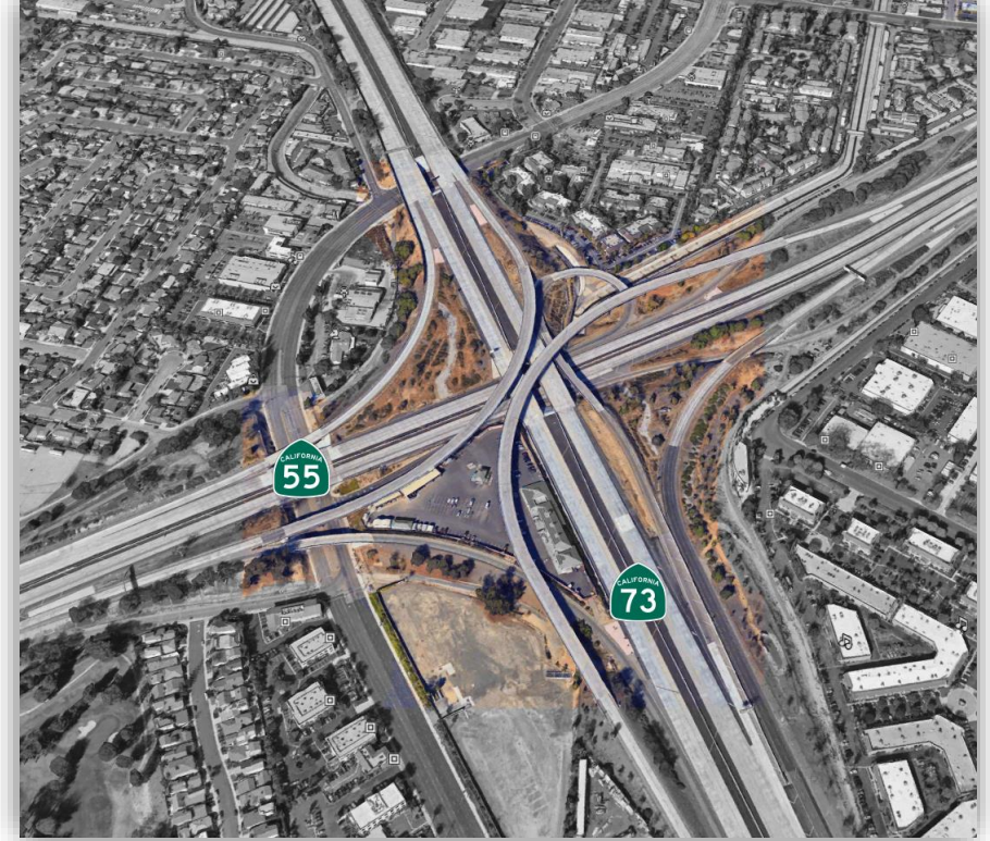
Bridge Seismic Restoration Project