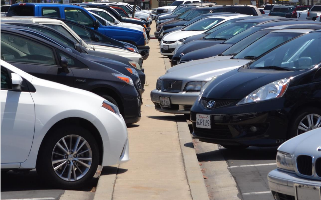
Park and Ride Lot