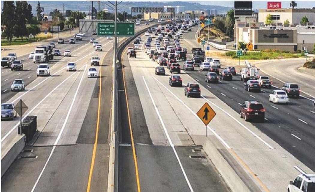
State Route 55