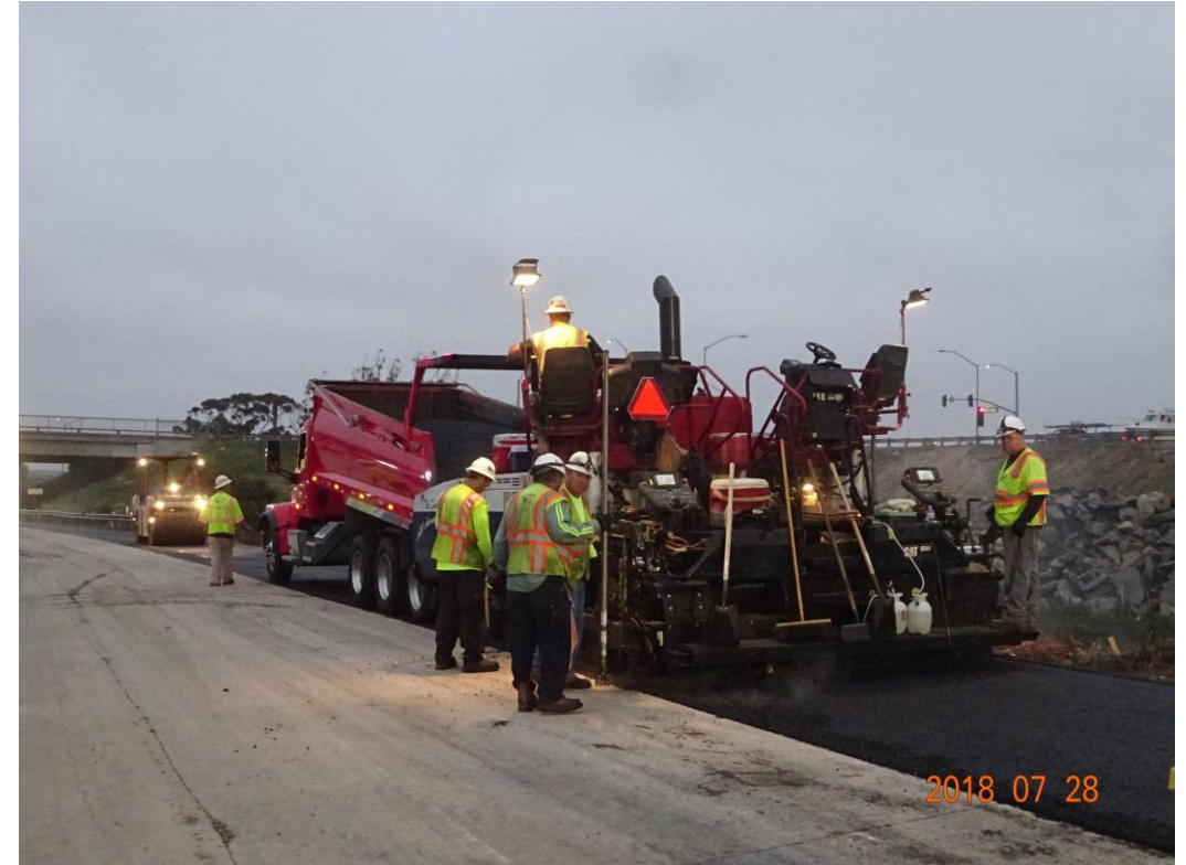
Temporary asphalt paving