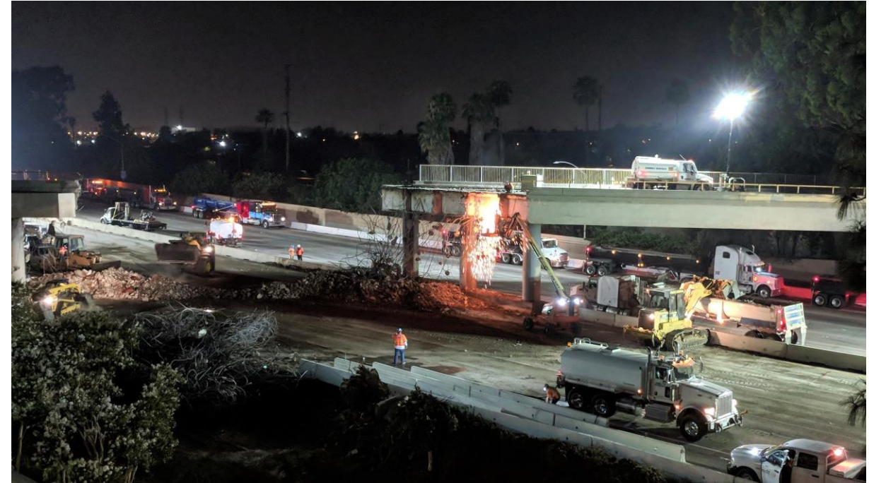
McFadden Avenue bridge demolition