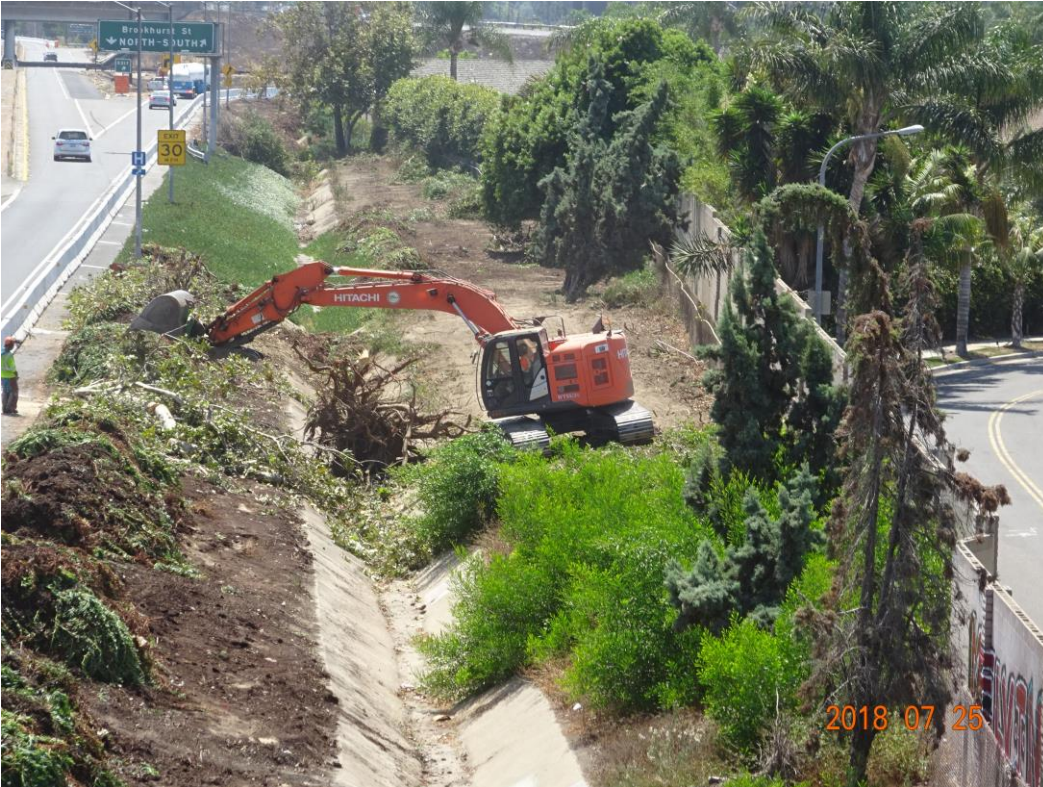
Clearing and grubbing