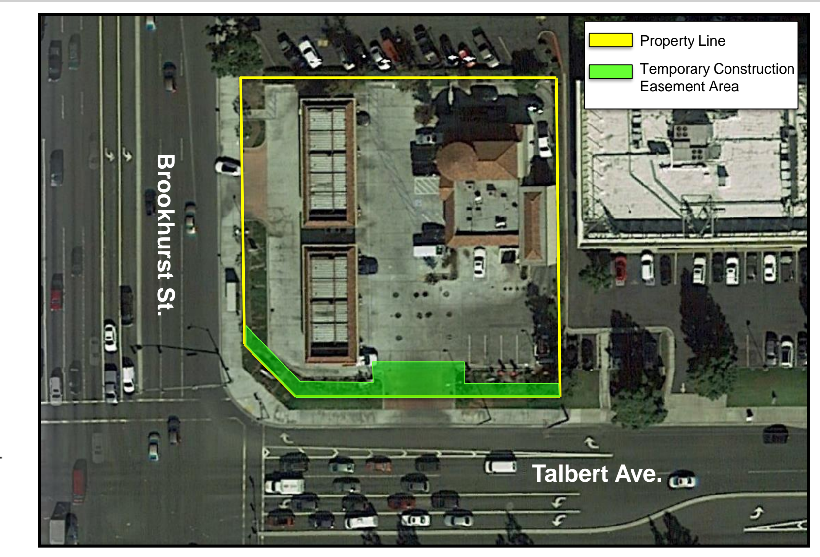
Not to Scale, For Presentation Purposes Only