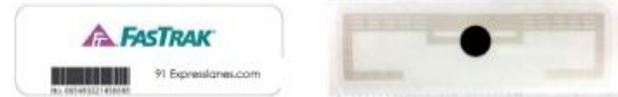
6C Switchable Transponders (Prototypes)