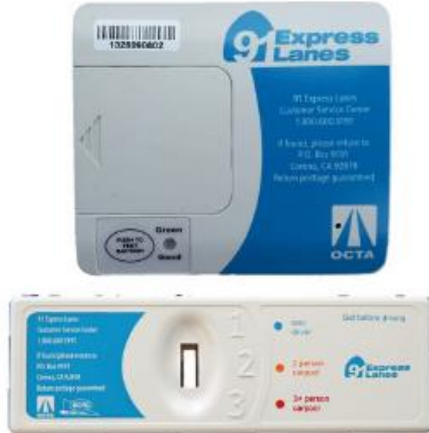
Title 21 Transponders