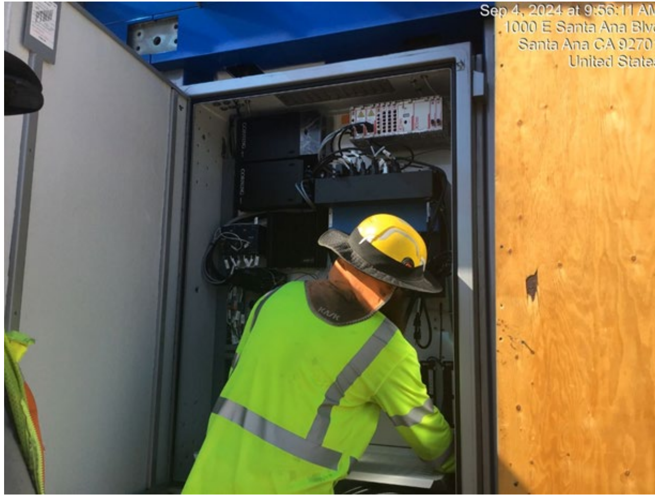
SARTC station cabinet configuration