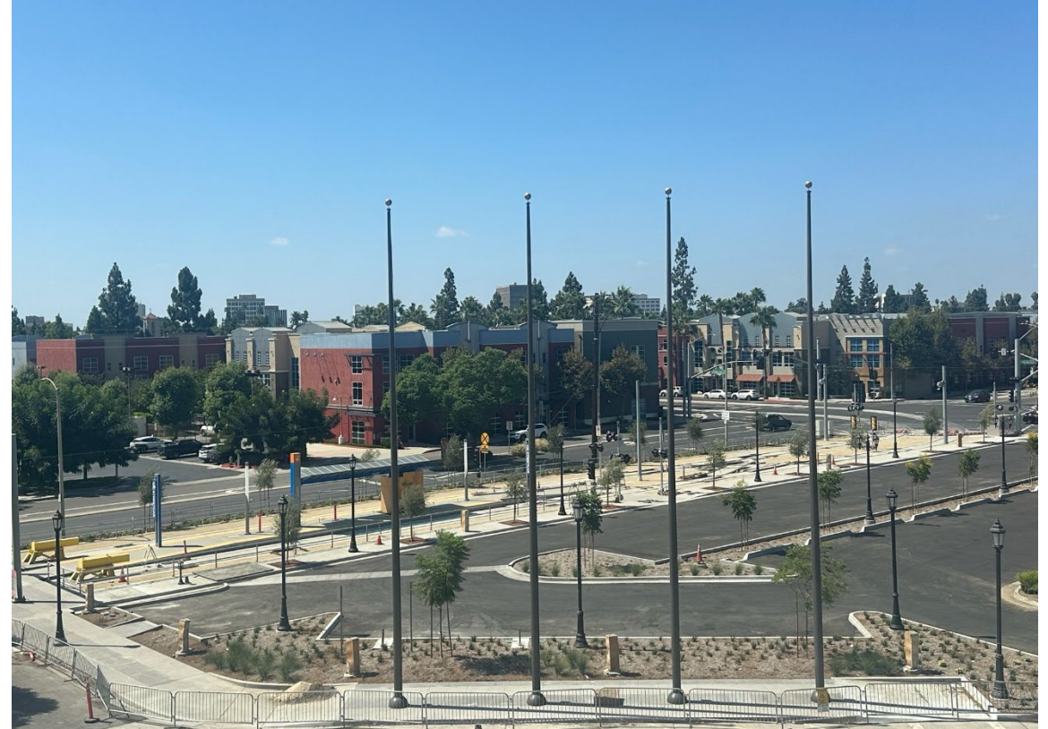
Santa Ana Regional Transportation Center (SARTC) parking lot and landscaping