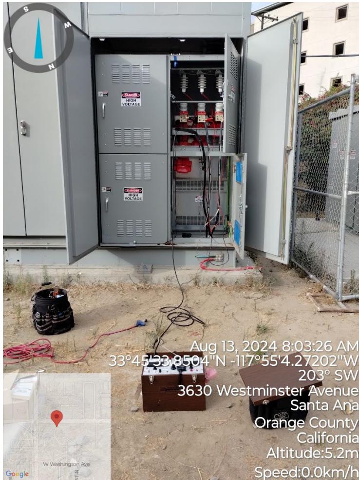
Traction power substation No. 1