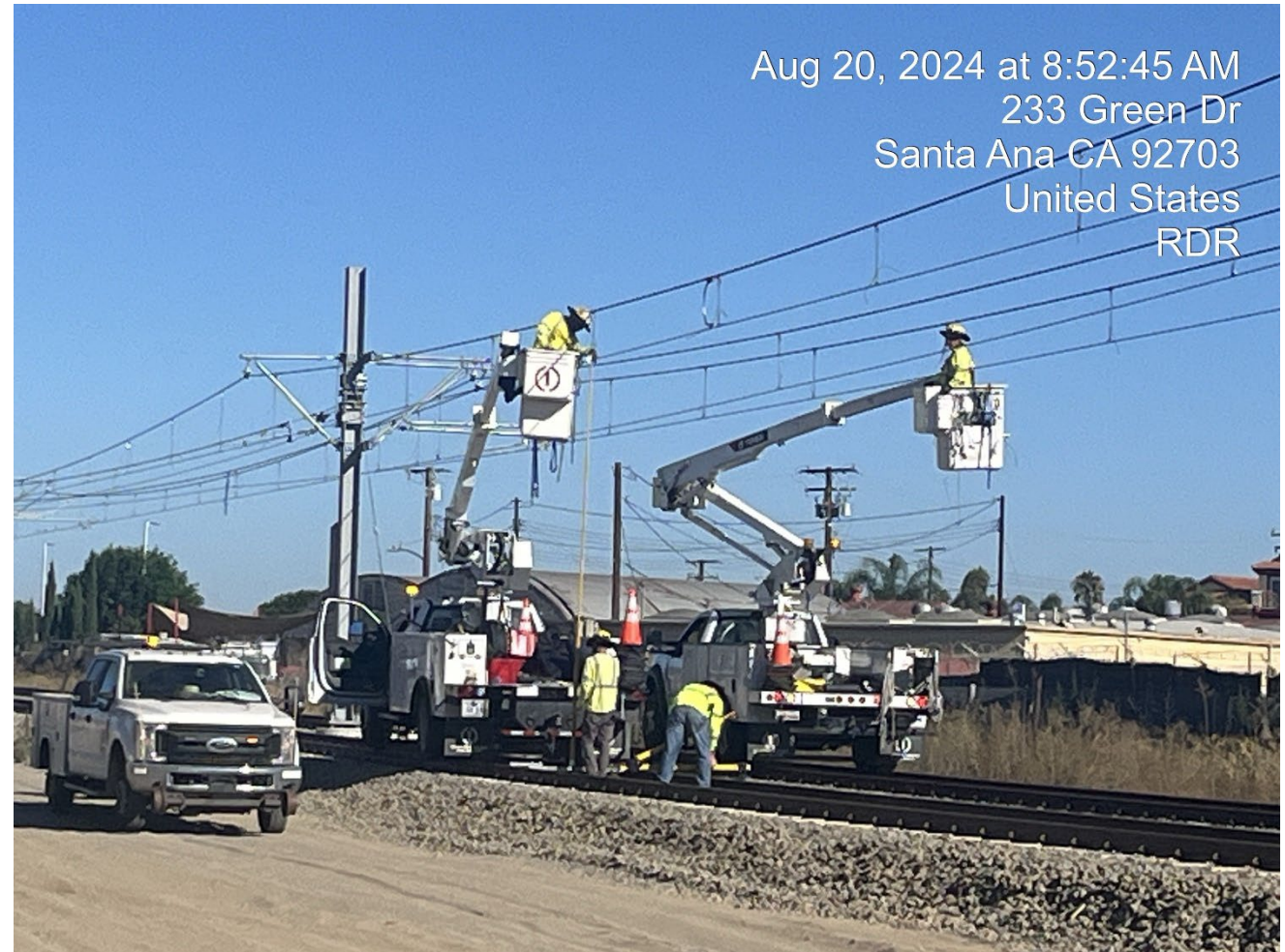
Overhead contact system (OCS) wire installation