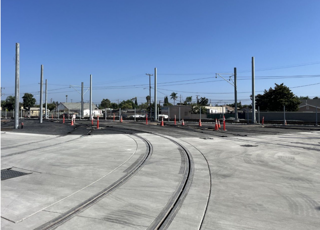
Yard track paving