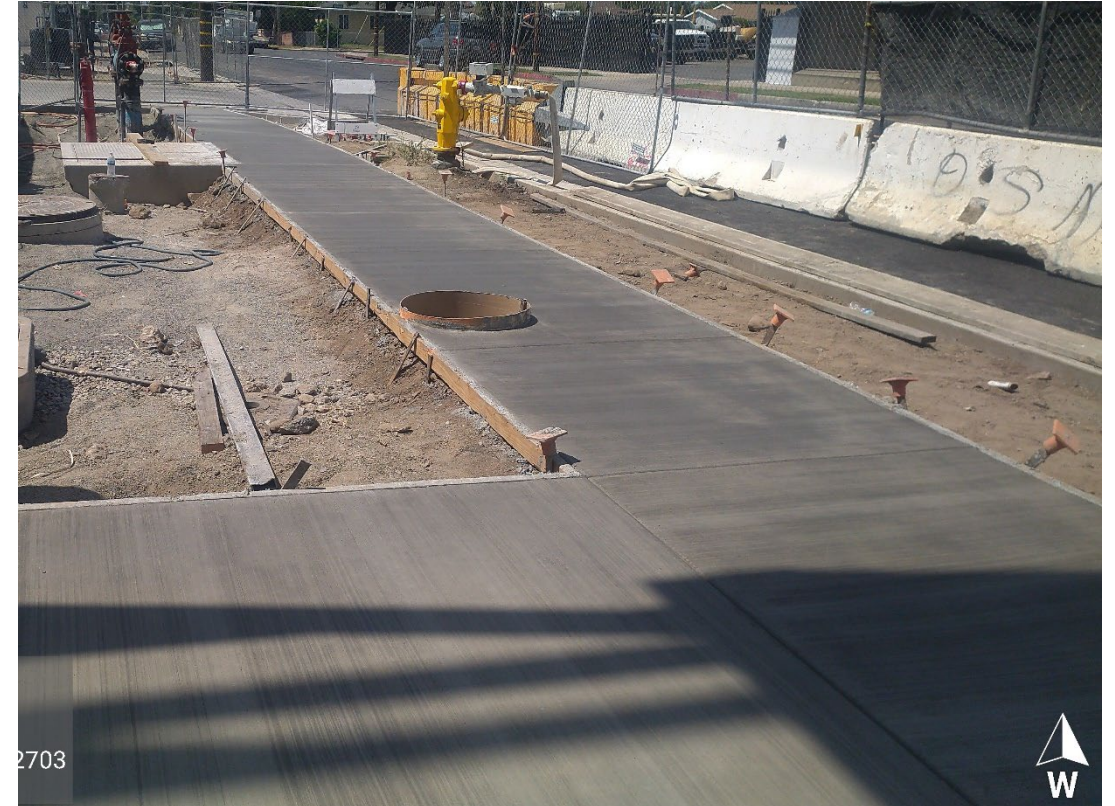
Sidewalk along Fifth Street