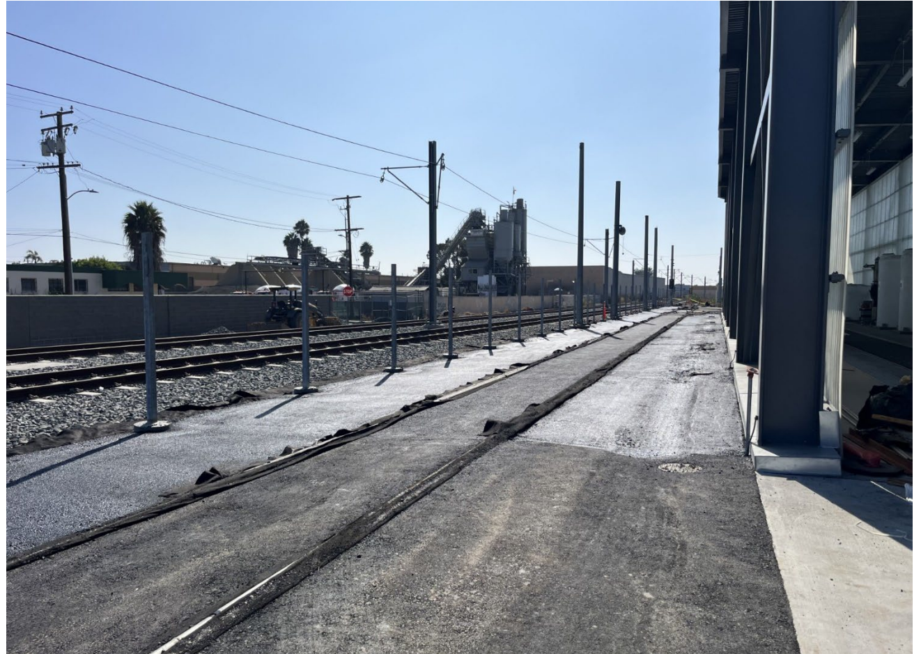
Paving behind car wash