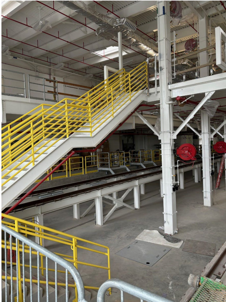
Maintenance Bay No. 1