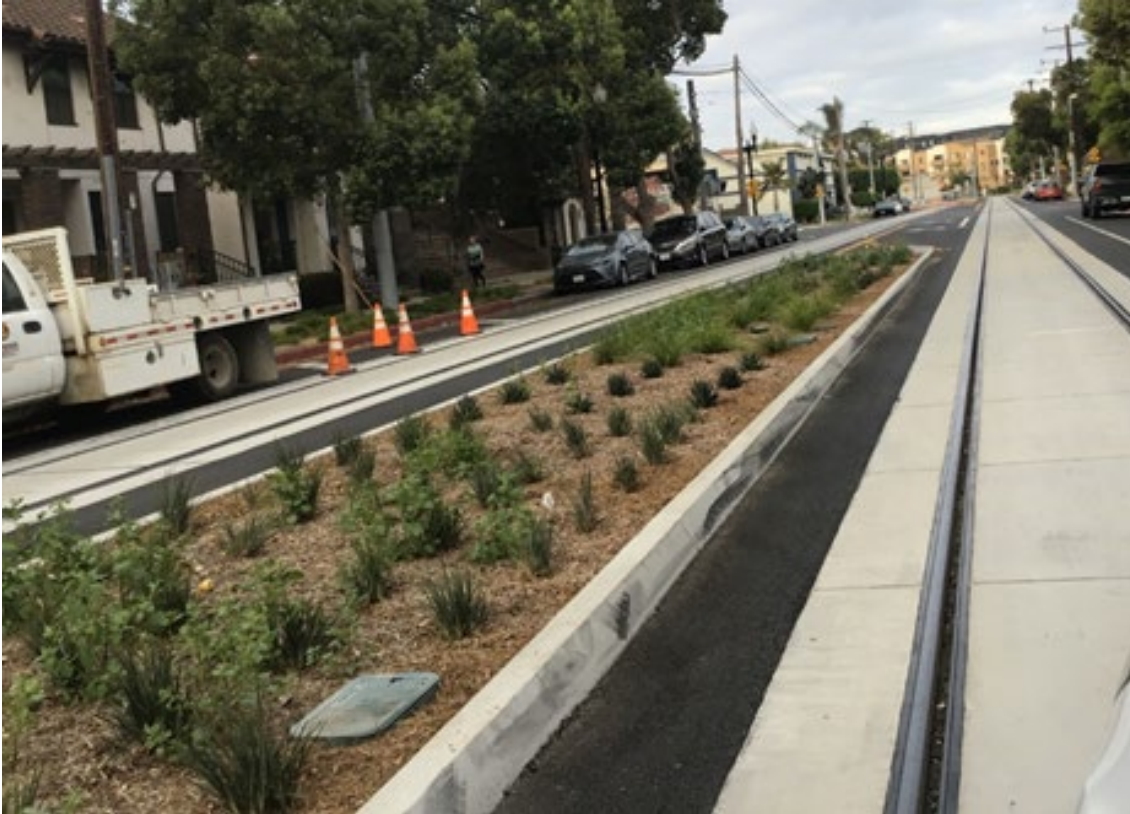
Median landscaping on Santa Ana Boulevard