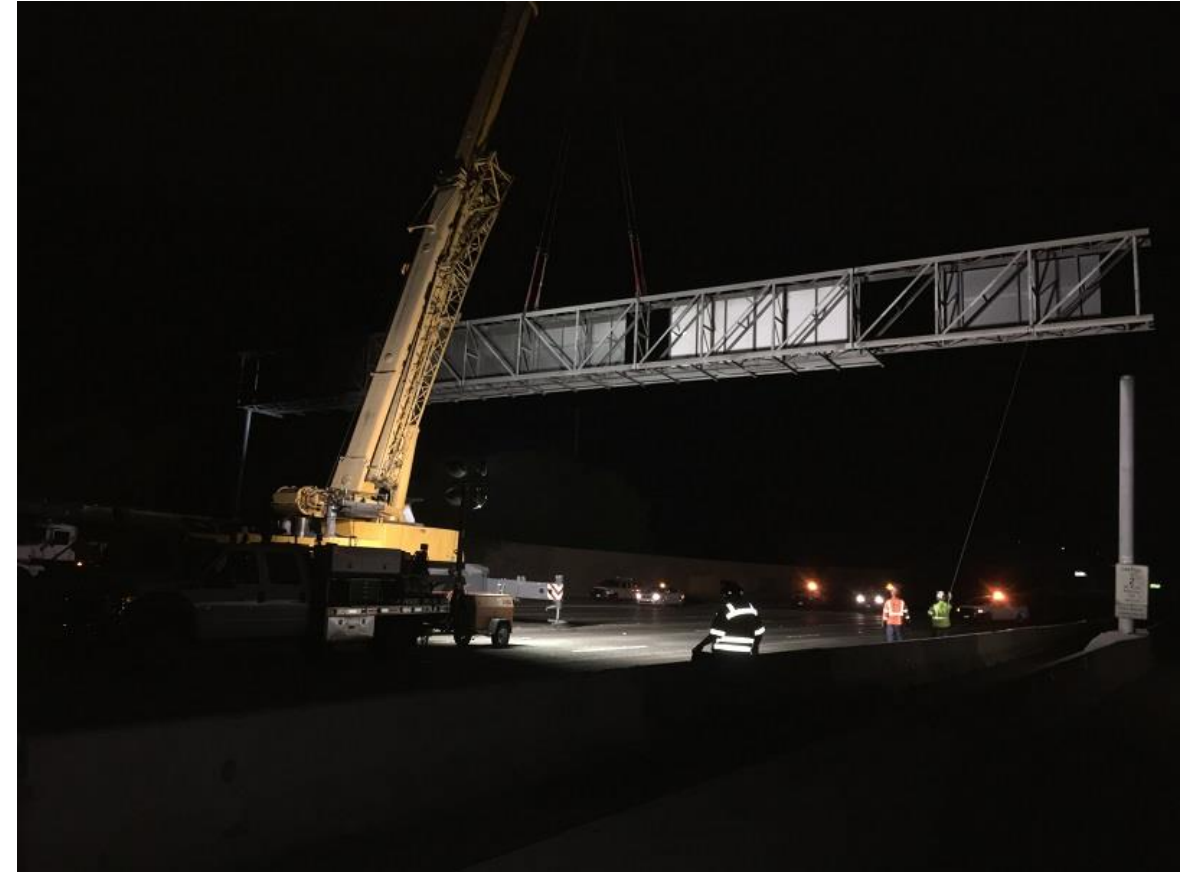
Overhead sign removal