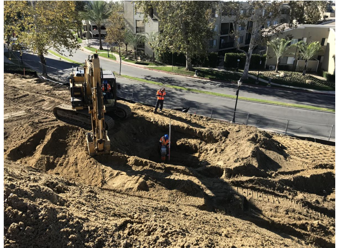
Goldenwest and McFadden embankments