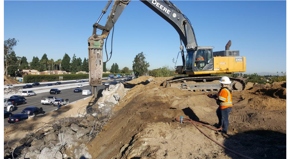
Slater Avenue full bridge demolition – September 2018