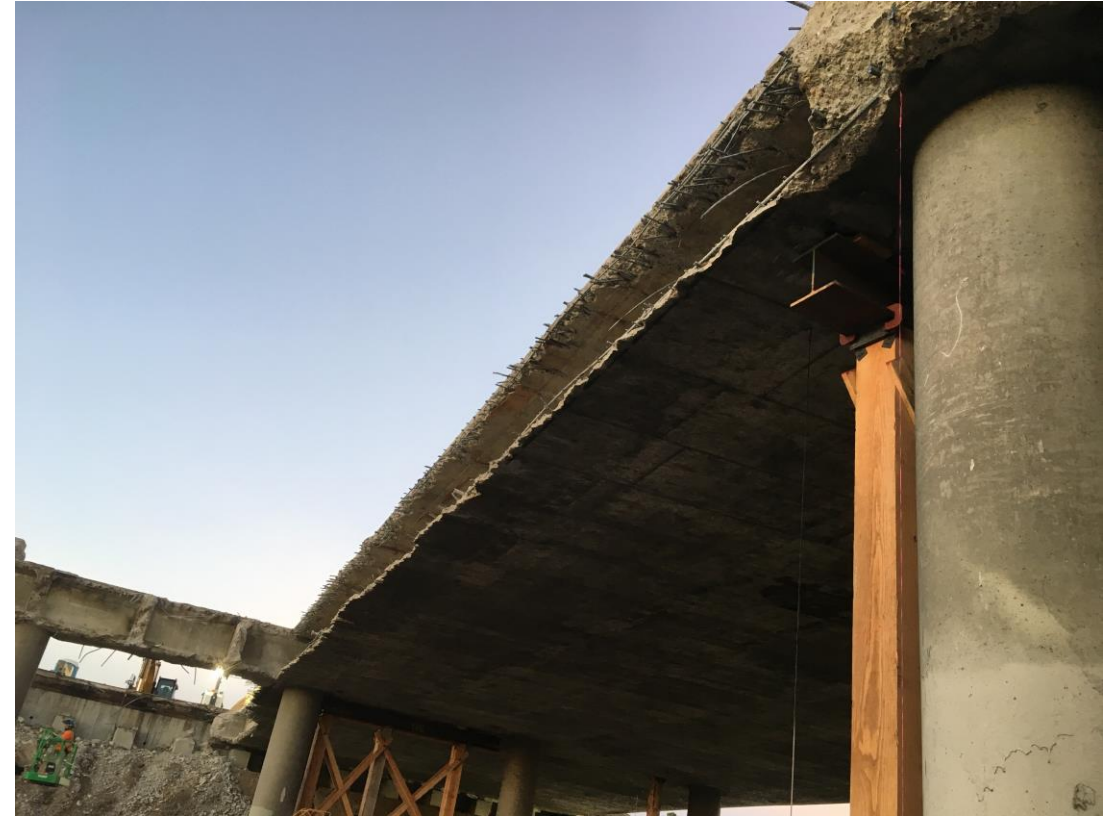
Bolsa Chica Road partial bridge demolition – December 2018