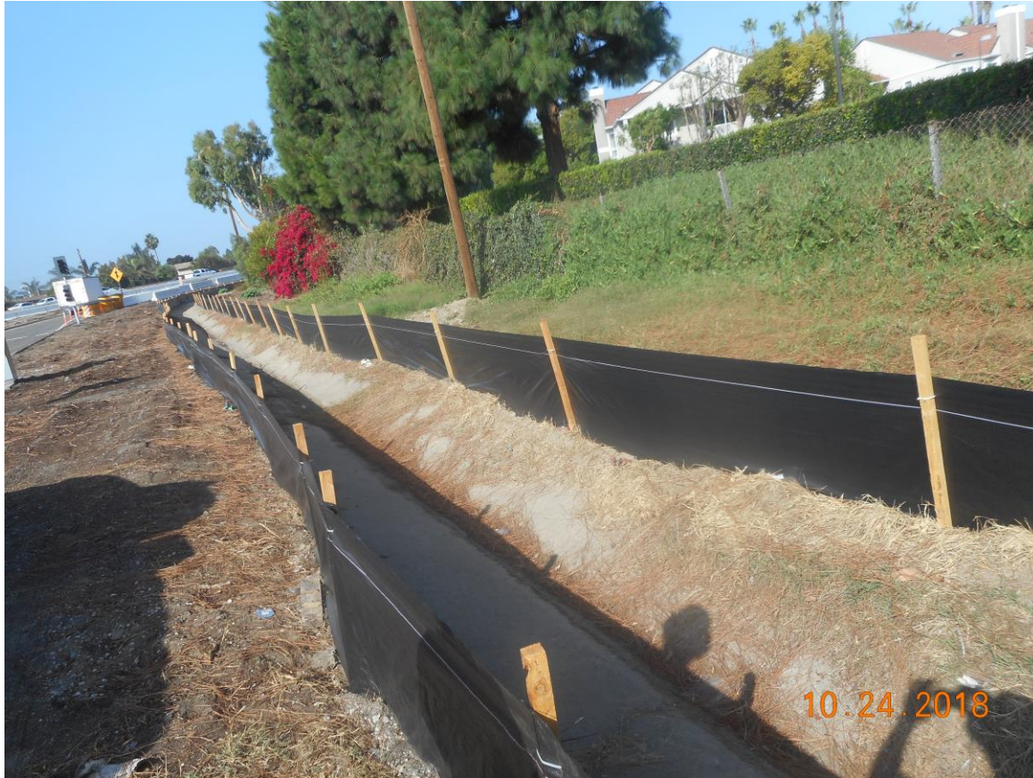
Storm water treatment measures