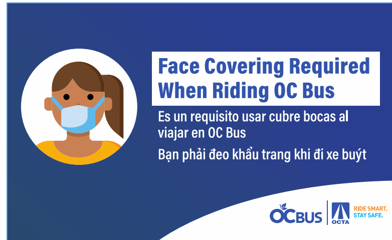
Bus Interior Card