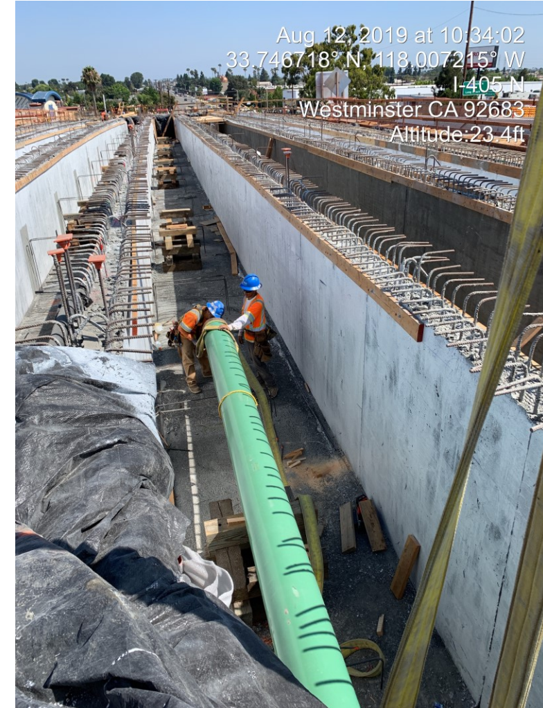
Goldenwest Street bridge construction