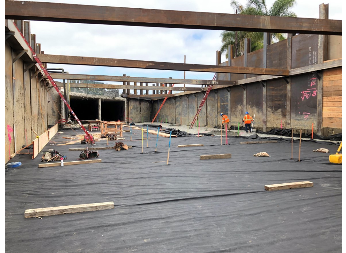
Oceanview Channel construction