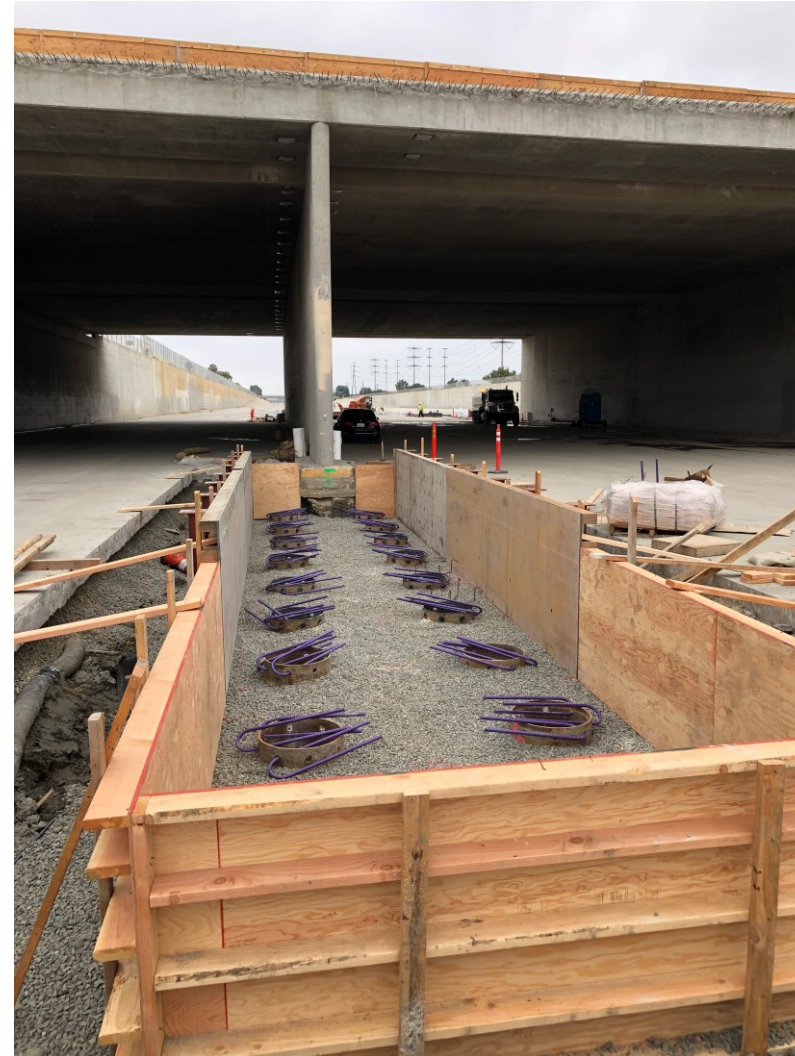
Santa Ana River bridge construction

Santa Ana River bridge construction can only take place in the “dry season” (inside the river channel)