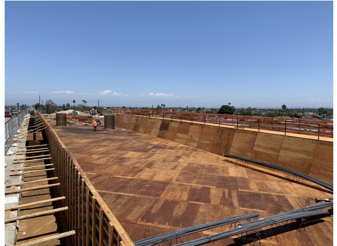
Magnolia Street bridge construction