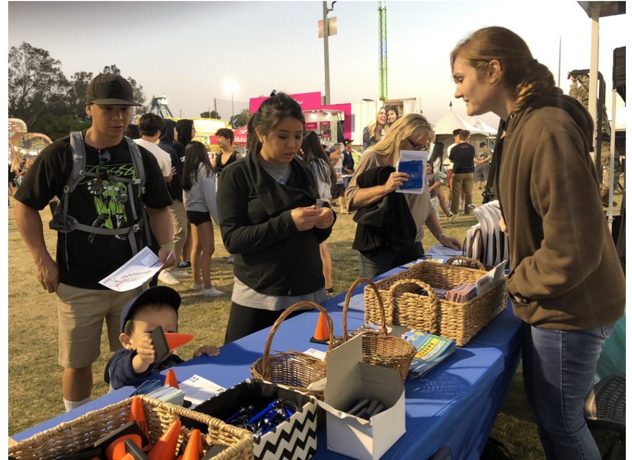
2019 Fountain Valley Summerfest