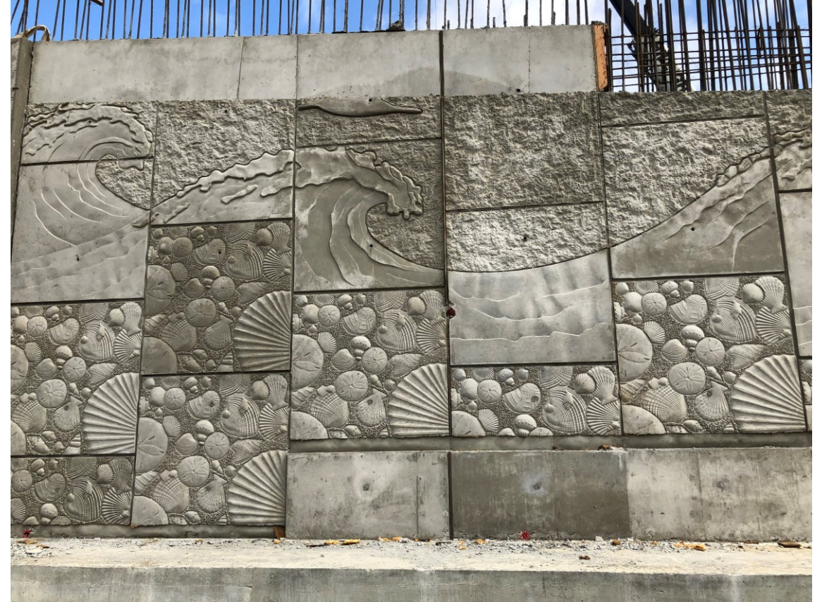
McFadden Avenue bridge construction