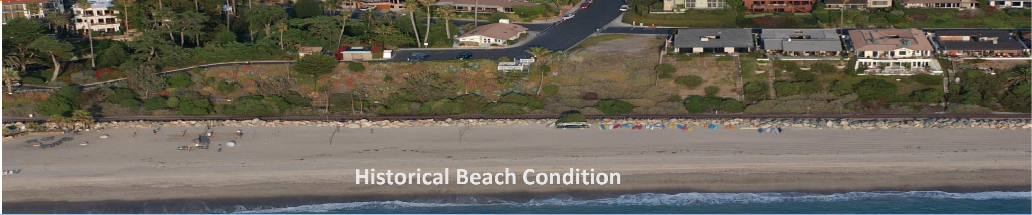
Historical Beach Condition