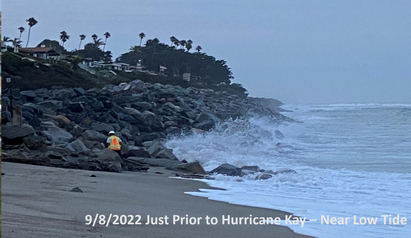
9/8/2022 Just Prior to Hurricane Kay – Near Low Tide