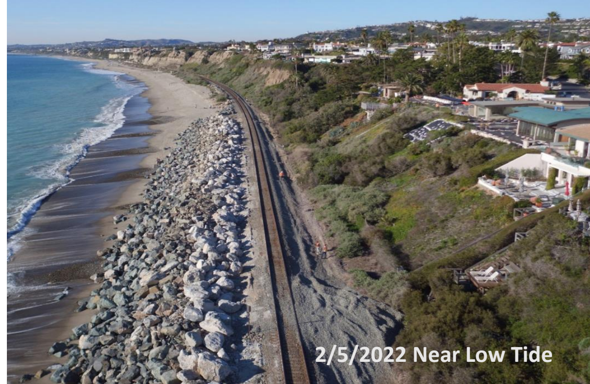
2/5/2022 Near Low Tide