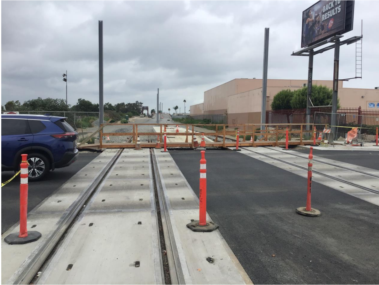
Fairview Street Crossing and Station Stop