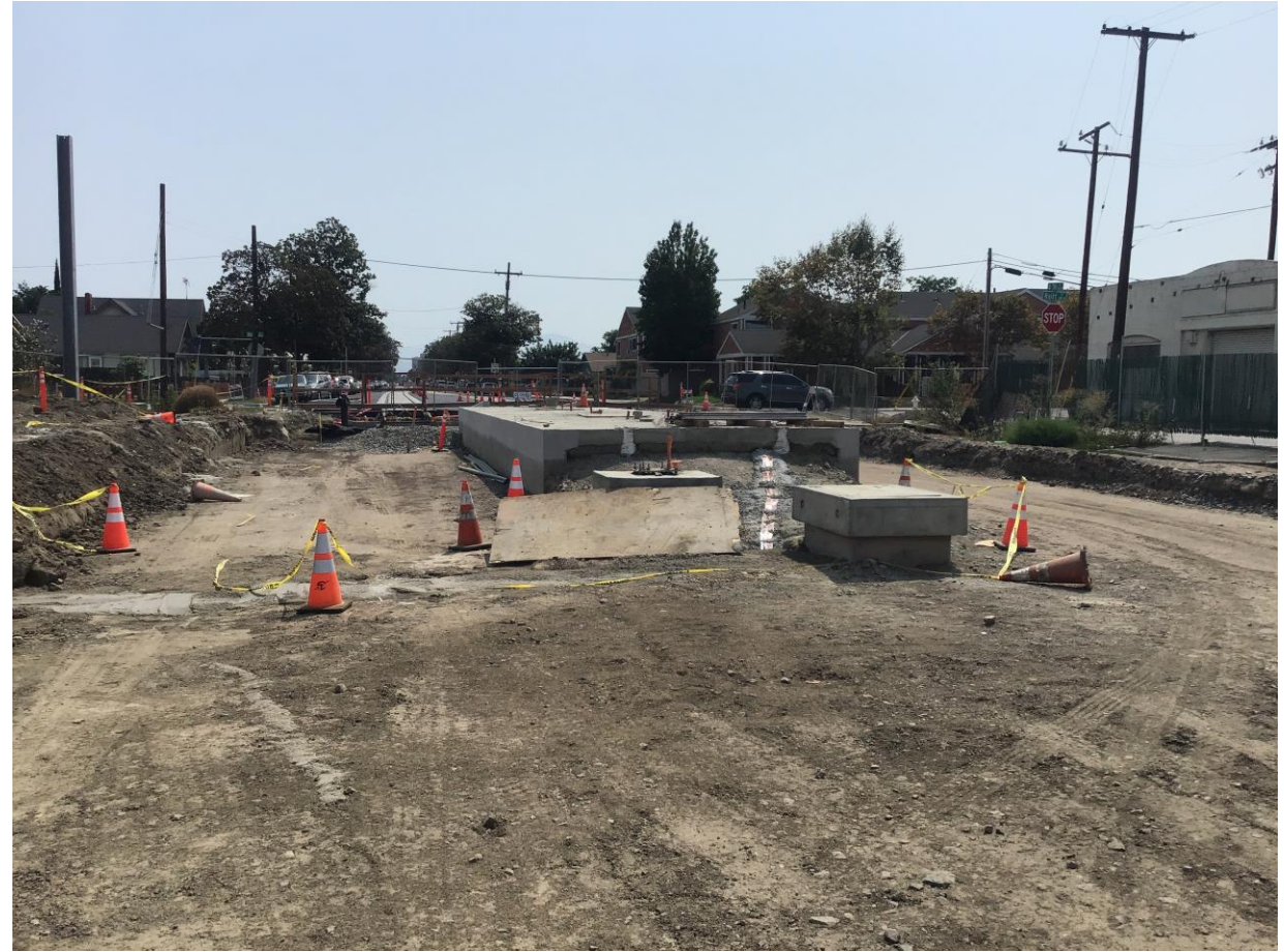
Raitt Station Stop