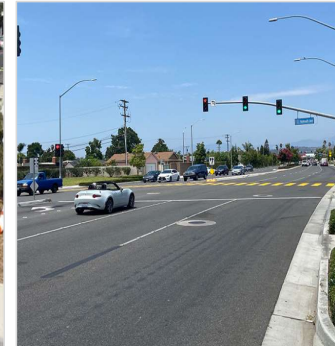
Brookhurst Street Improvements City of Anaheim