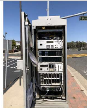
Seal Beach Boulevard/ Bolsa Avenue City of Seal Beach