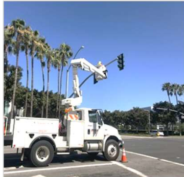
Irvine Center Drive/ Edinger Avenue City of Irvine

Project P funds awarded to date: $142.3 million