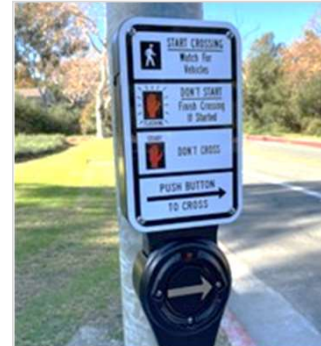
Marguerite Parkway City of Mission Viejo