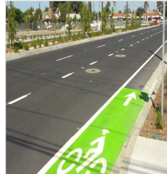
Grand Avenue Improvements City of Santa Ana