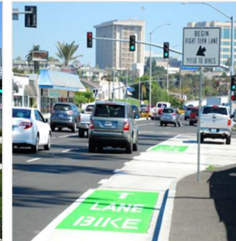
Newport Boulevard Improvements City of Newport Beach