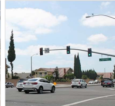
Edinger Avenue City of Fountain Valley