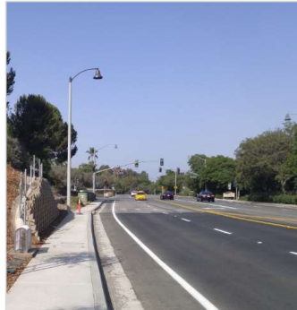
Del Obispo Improvements City of San Juan Capistrano