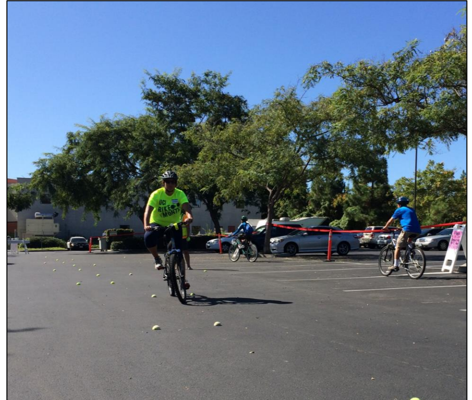
University of California, Irvine Bicycle Month Skills Course