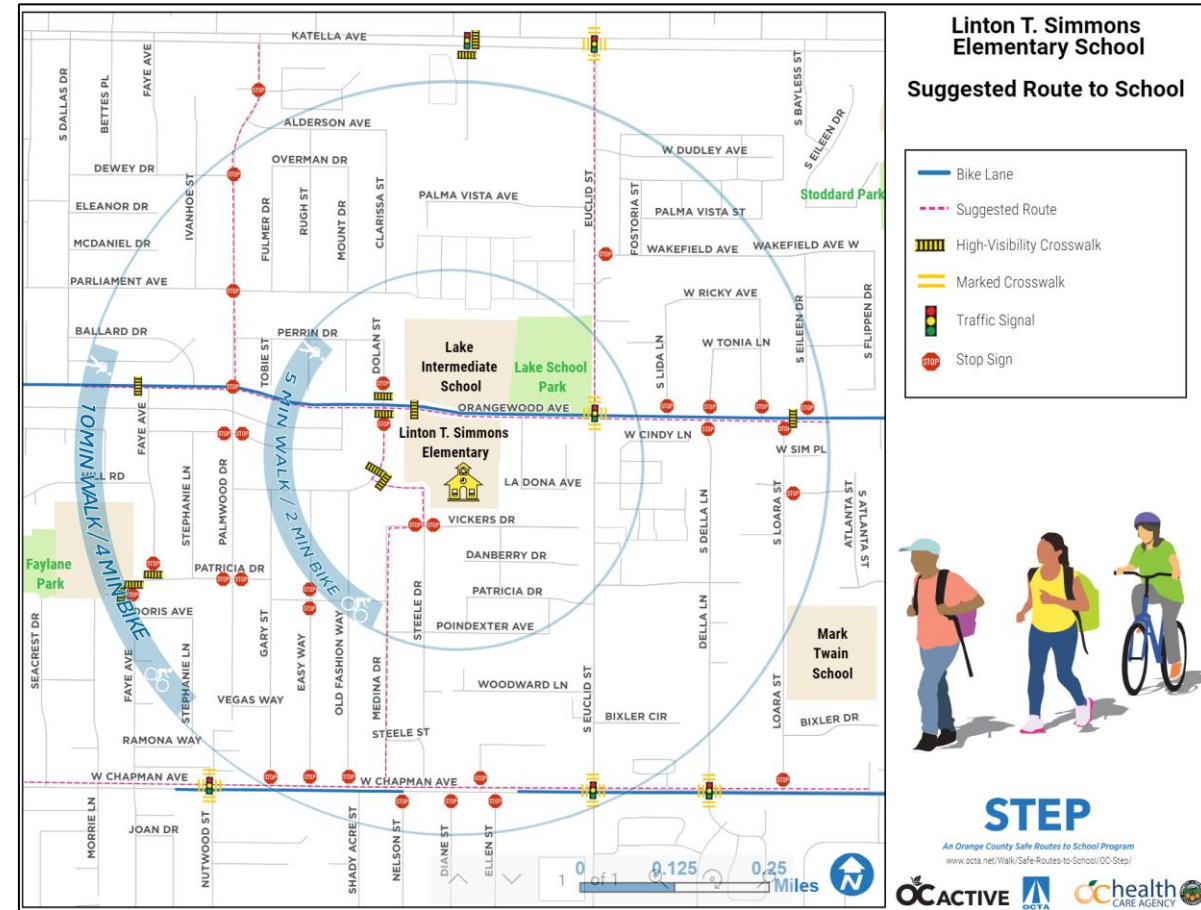
Suggested Route Mapping