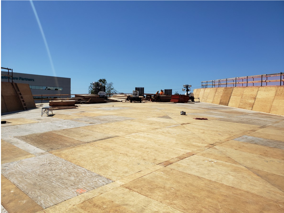
McFadden Avenue bridge construction