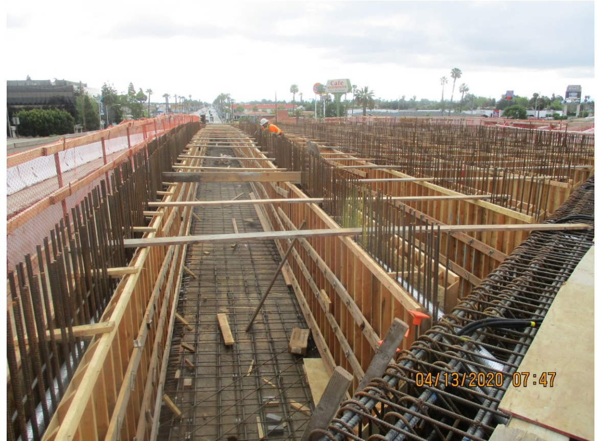
Westminster Boulevard bridge construction