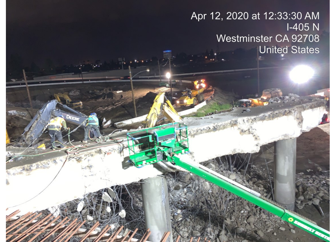
Magnolia Street bridge demolition