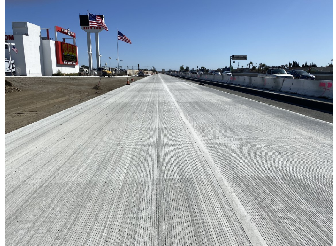
Concrete pavement construction