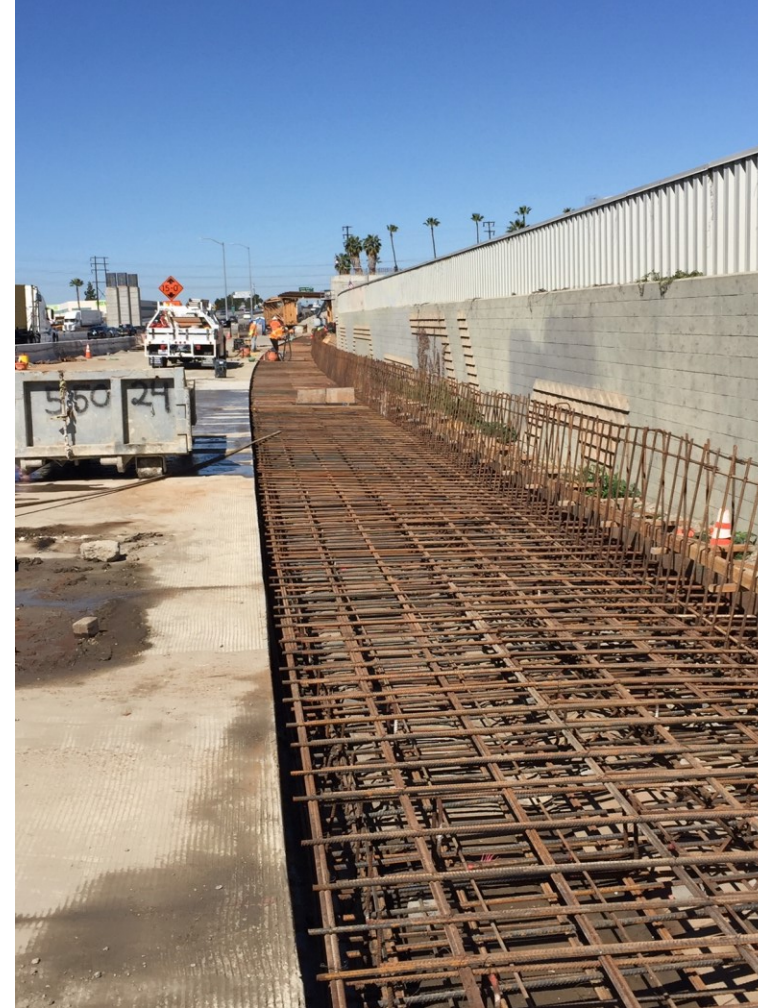
Drainage and other roadway construction