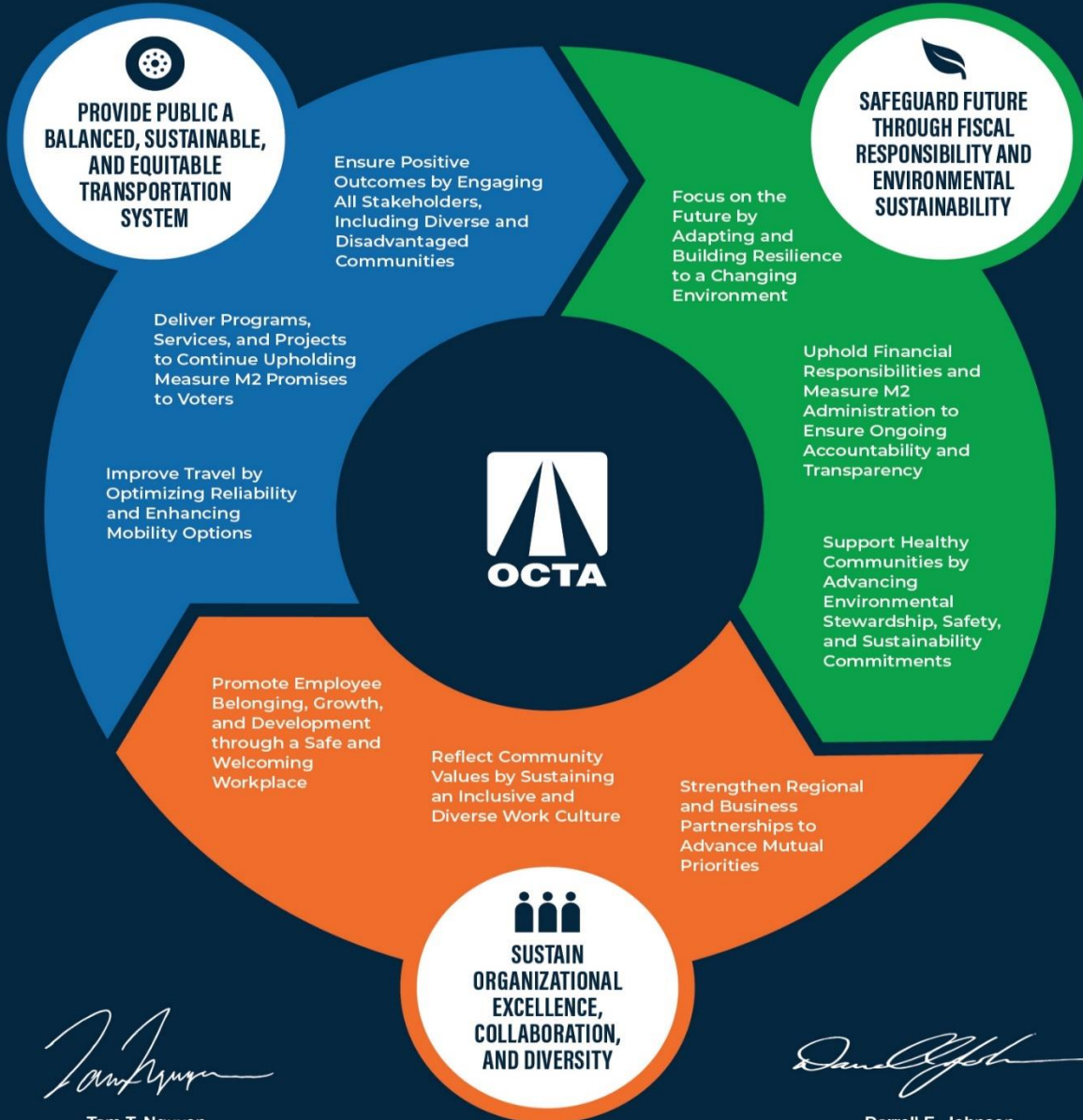
Tam T. Nguyen Chair