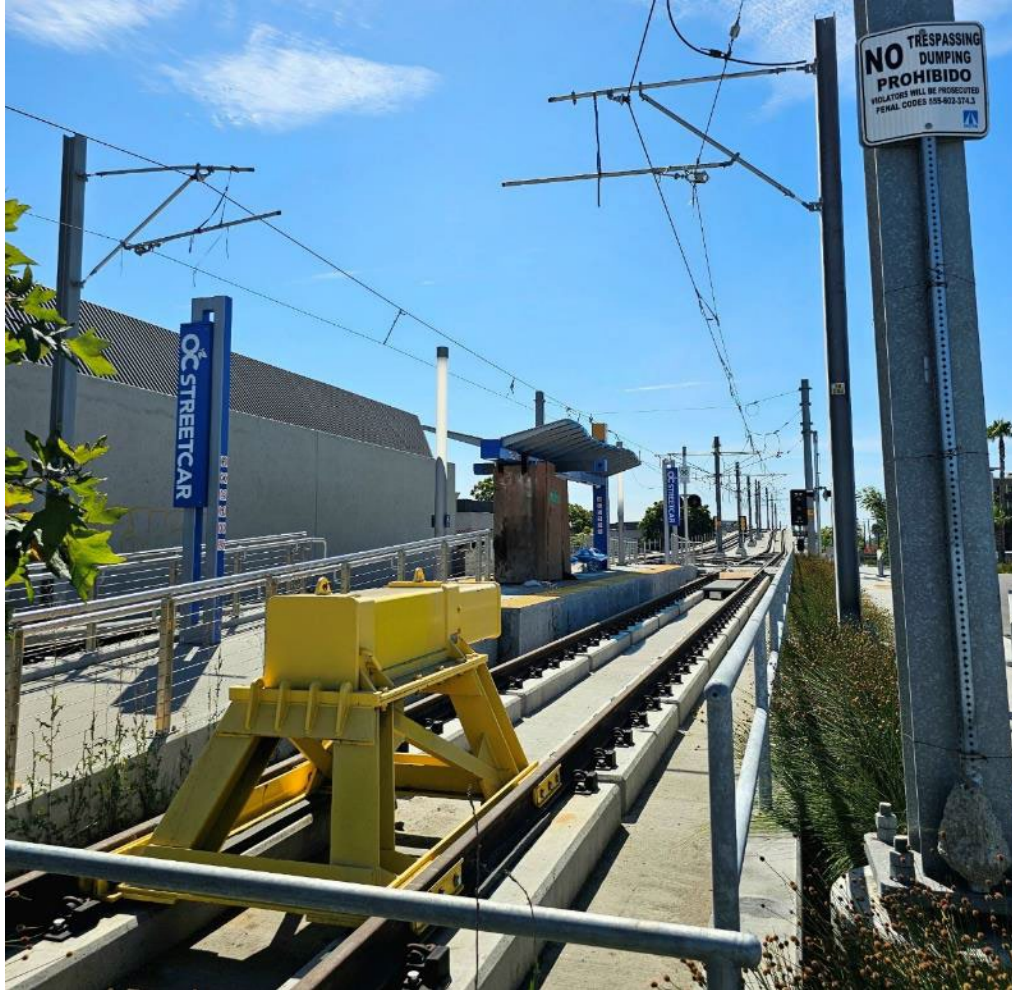
Harbor Station complete