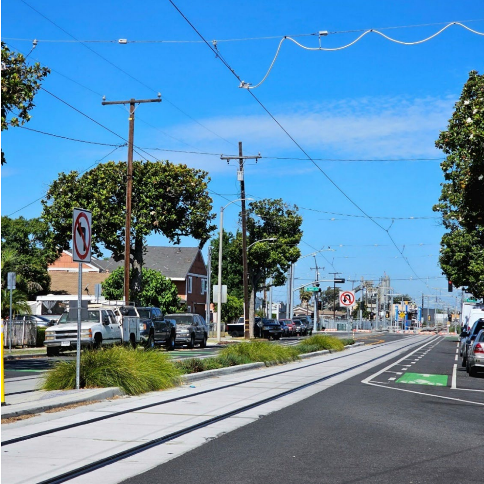
Installation of overhead contact system wire