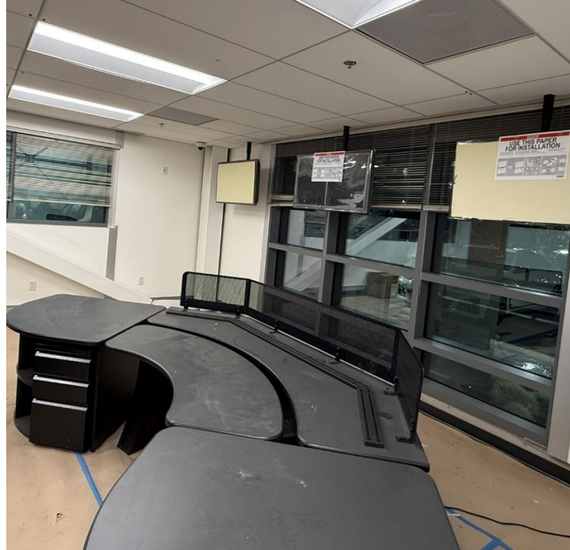
Installation of furniture and workstations