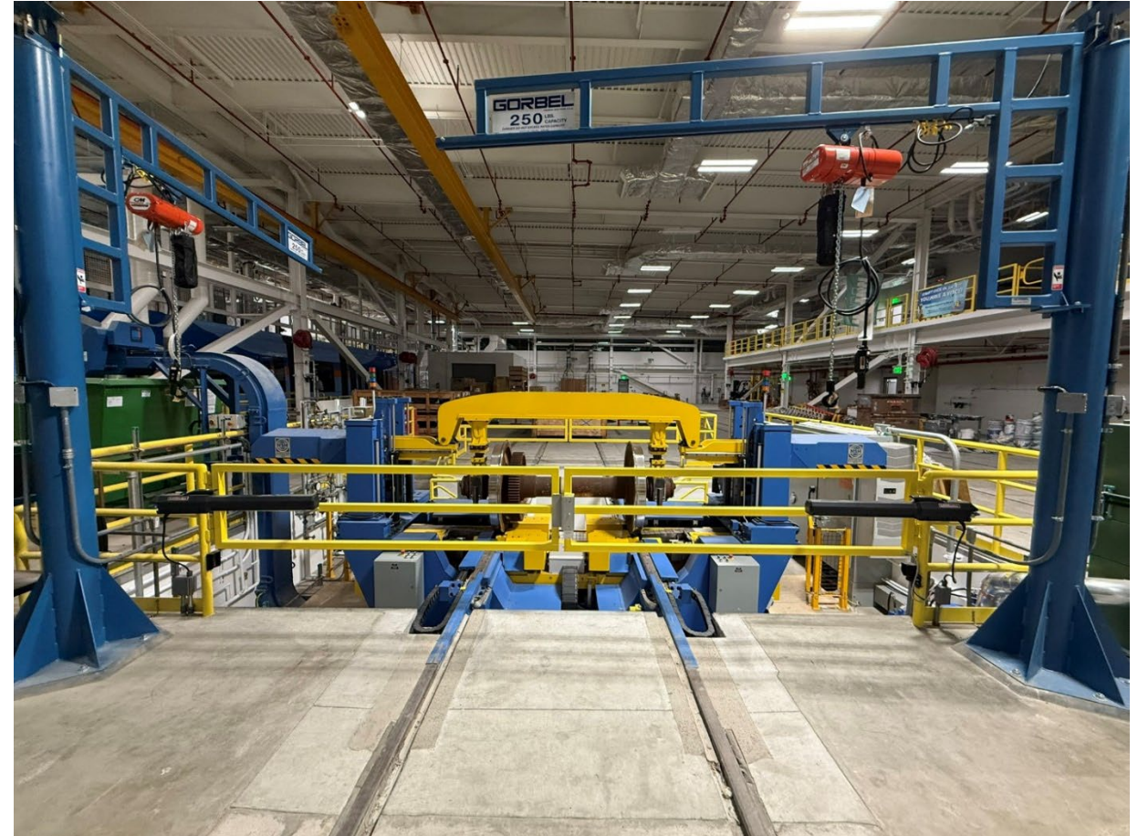
Wheel truing machine