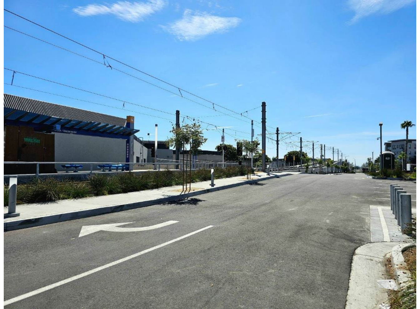
Final striping at Harbor Station