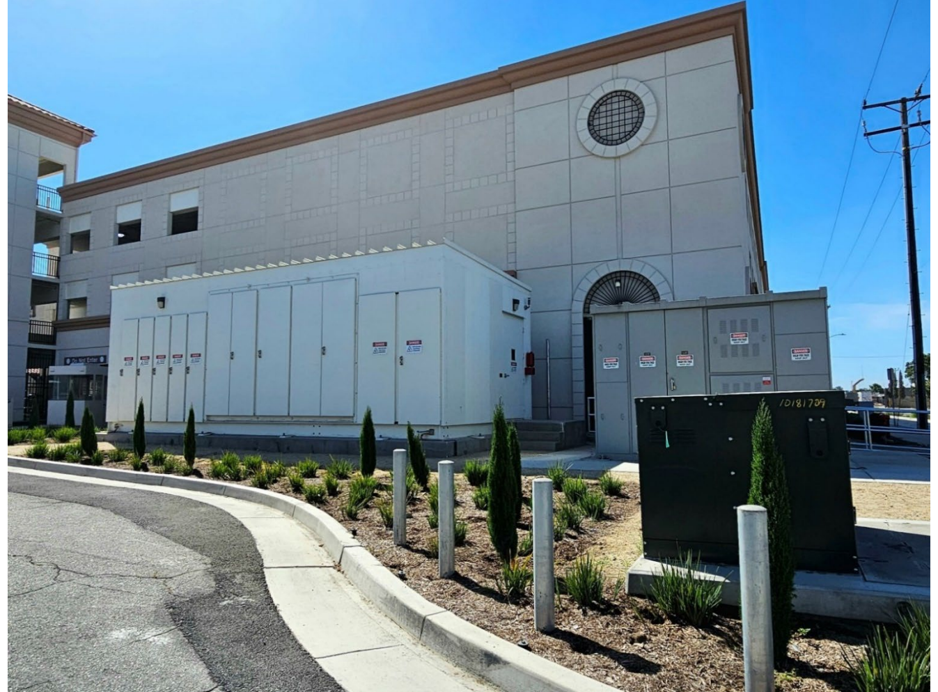
Traction Power Substation 4 energized