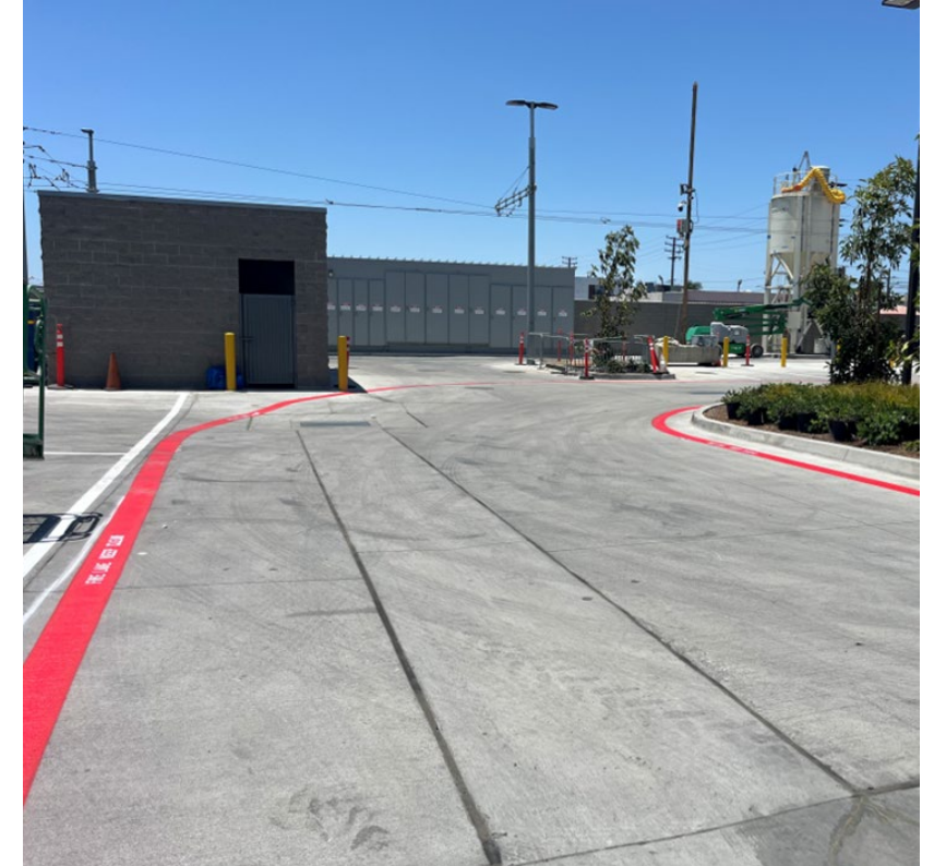
Parking lot striping, including fire lane