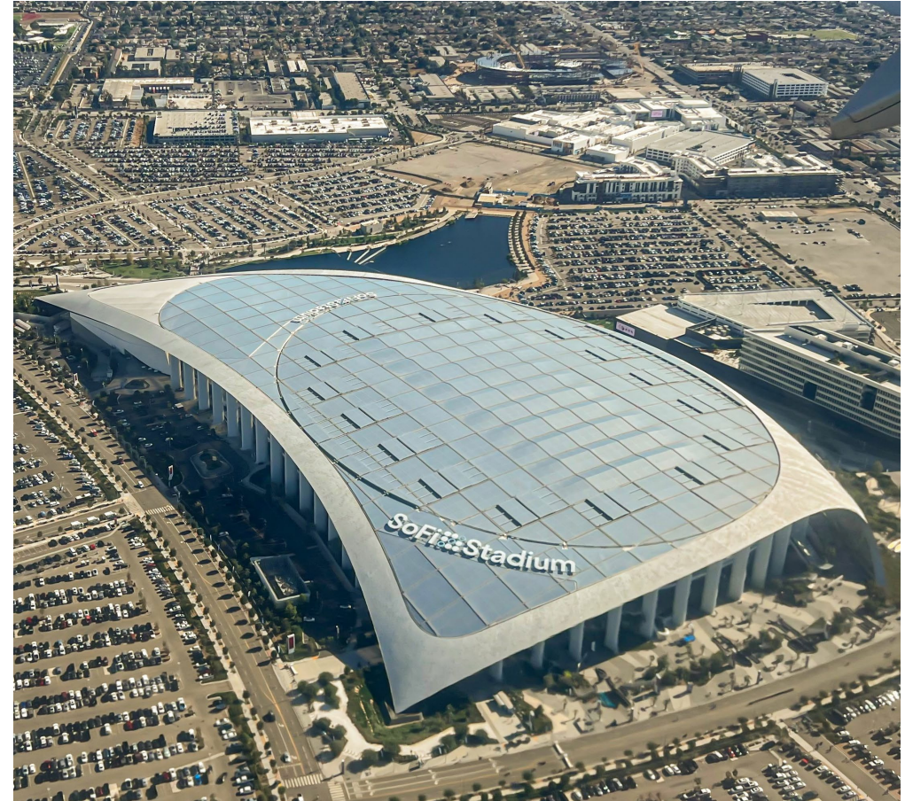
ARTIC - Anaheim Regional Transportation Intermodal Center SoFi - SoFi Stadium USA - United States of America WC26 - FIFA World Cup 2026